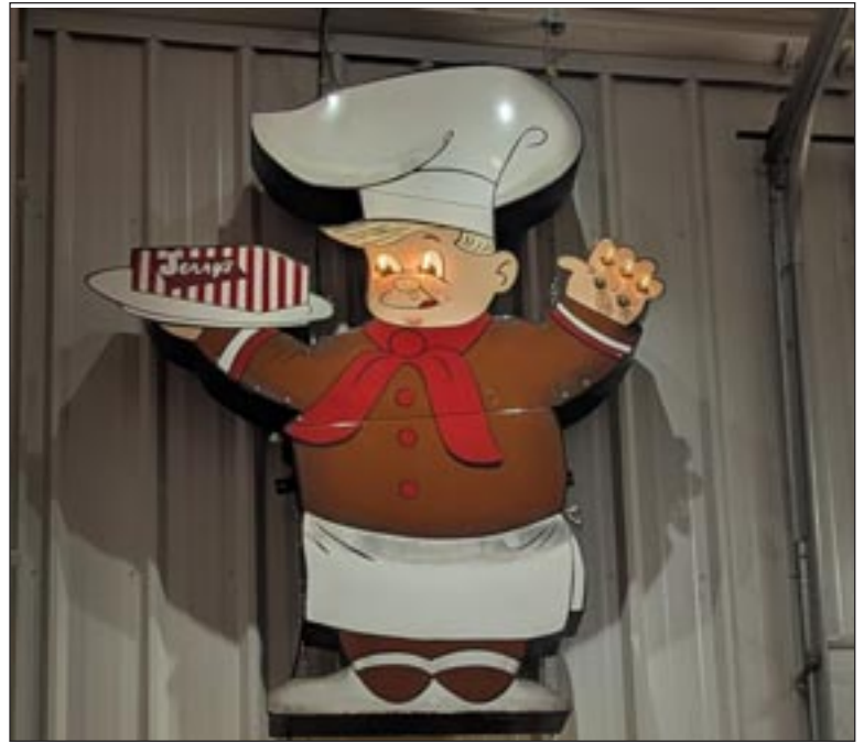
LEFT A menagerie of two-wheeled fun! Schwinn bikes of all types to bring joy to boys and girls alike. ABOVE This rare sign is from a Jerry's Restaurant, an nearly vanished chain. BELOW More neon, a carousel, a 1957 Ford Convertible and a Continental Mark II.