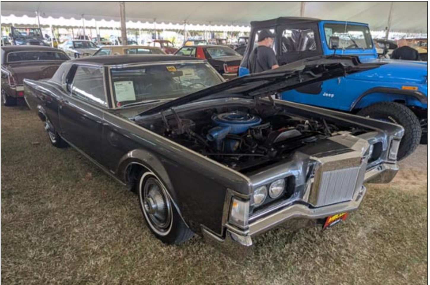
BELOW 1969 Lincoln Continental Mark III.