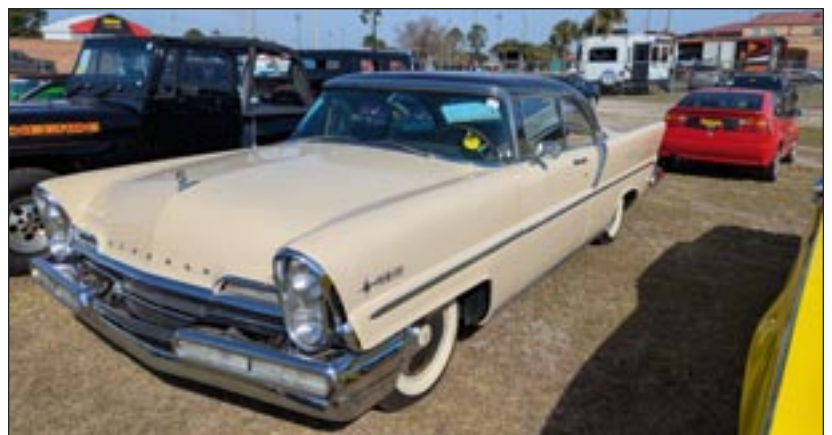
OPPOSITE PAGE 1979 Lincoln Continental Mark V Bill Blass Edition. TOP 1948 Lincoln Continental Coupe. ABOVE 1956 Continental Mark II. RIGHT 1957 Lincoln Premiere Coupe.