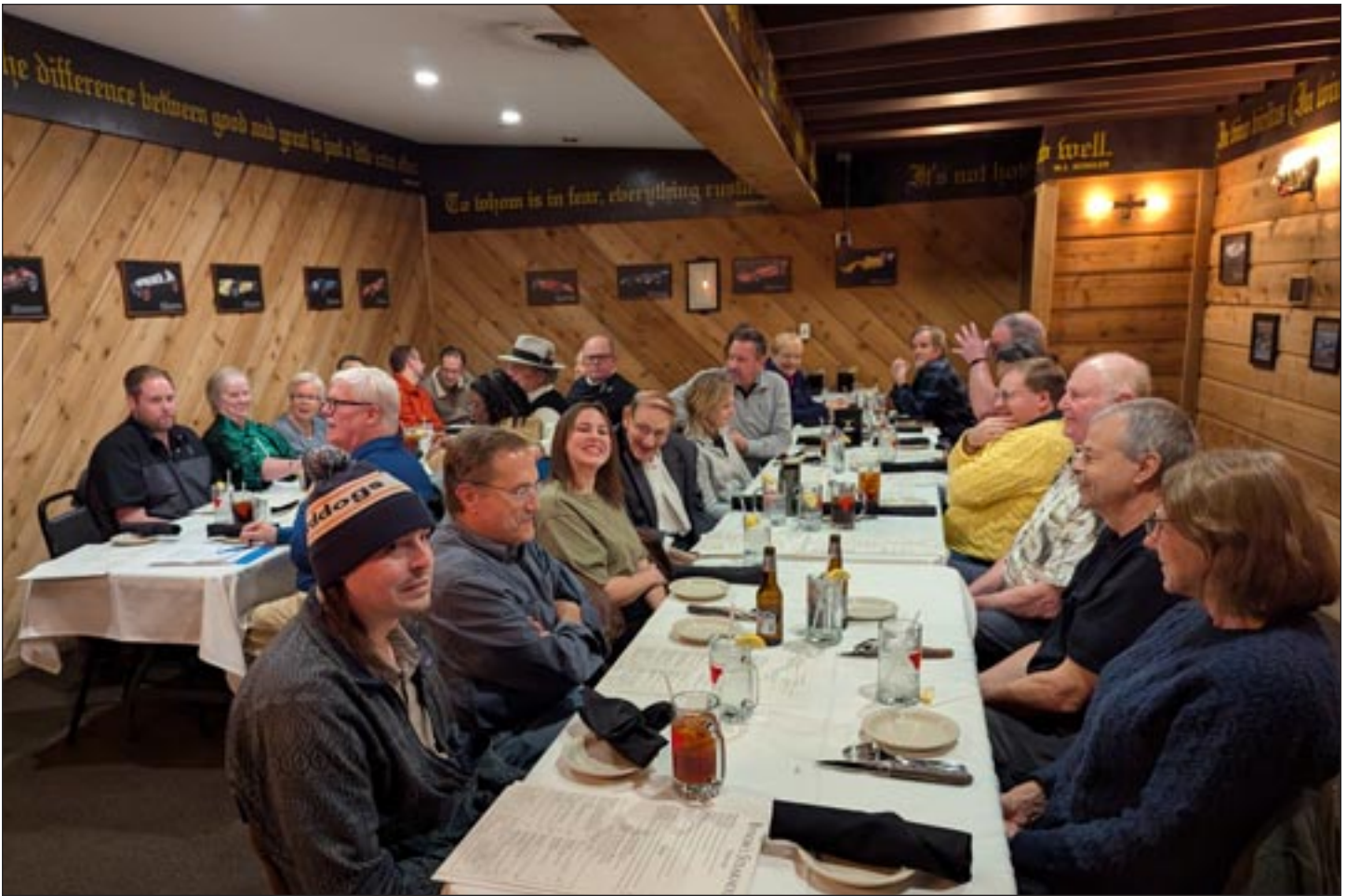
ABOVE Dinner was served, and it was wonderful!