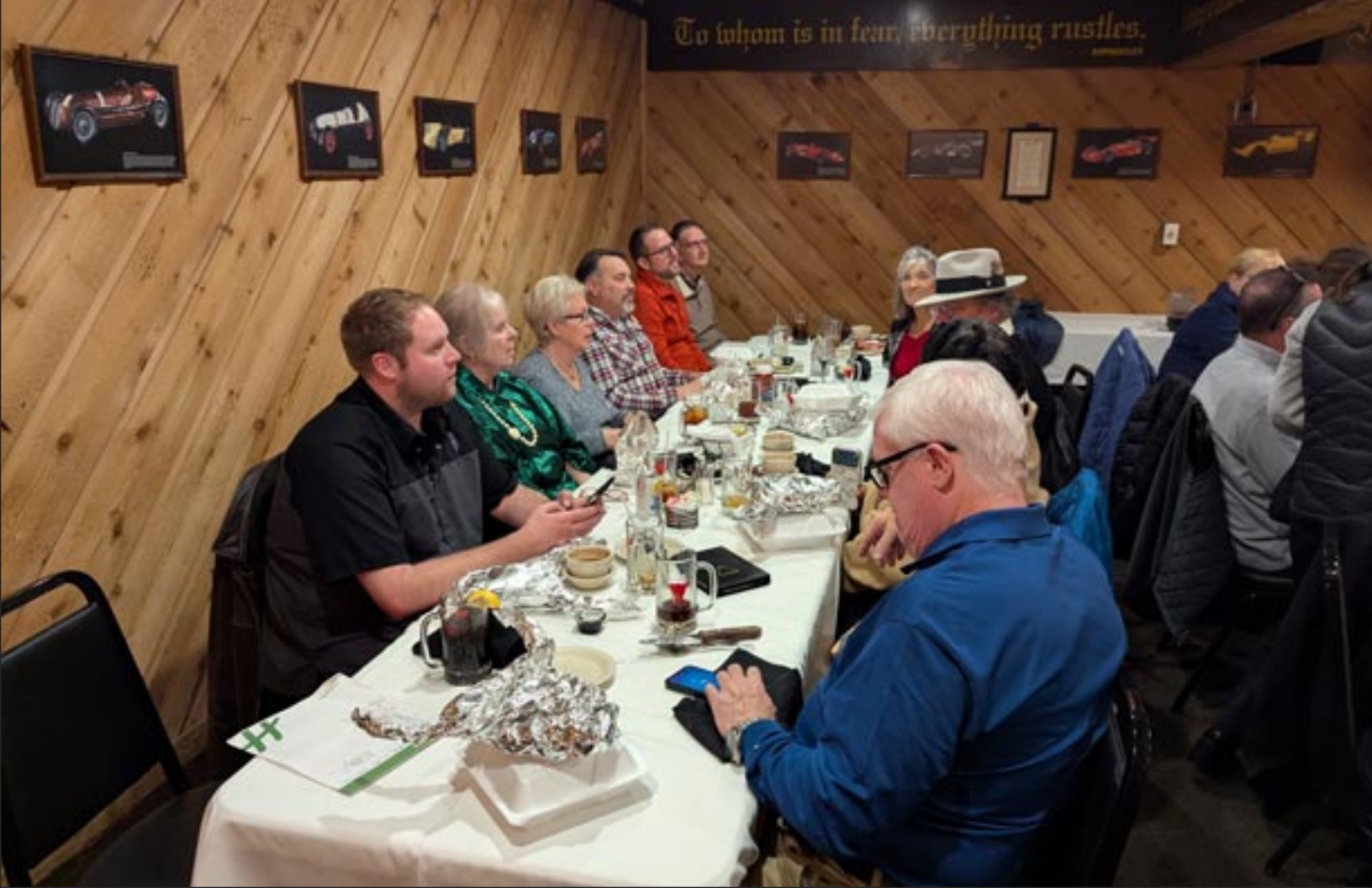
ABOVE Leftovers are wrapped and ready to provide another meal..or two well into the next week. RIGHT A cornucopia of Christmas cheer awaited during the gift exchange.

But of course, turnabout is fair play, so many presents passed through many hands before staying with the lucky recipient who'd be taking them home.