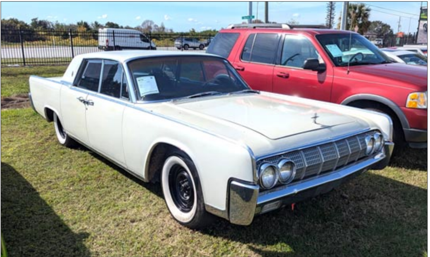
ABOVE 1964 Lincoln Continental Sedan.