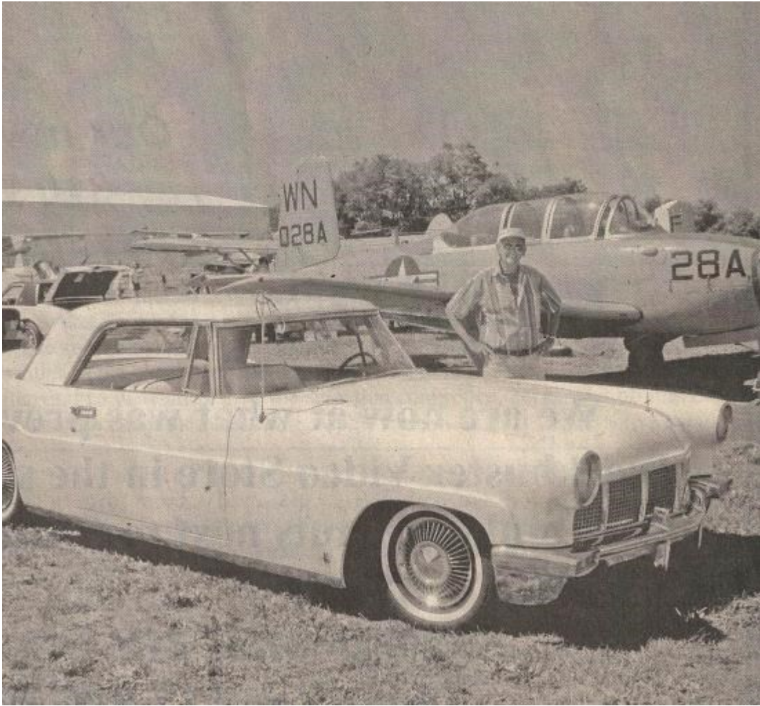
2010 Wings and Wheels in Blue Bell, PA