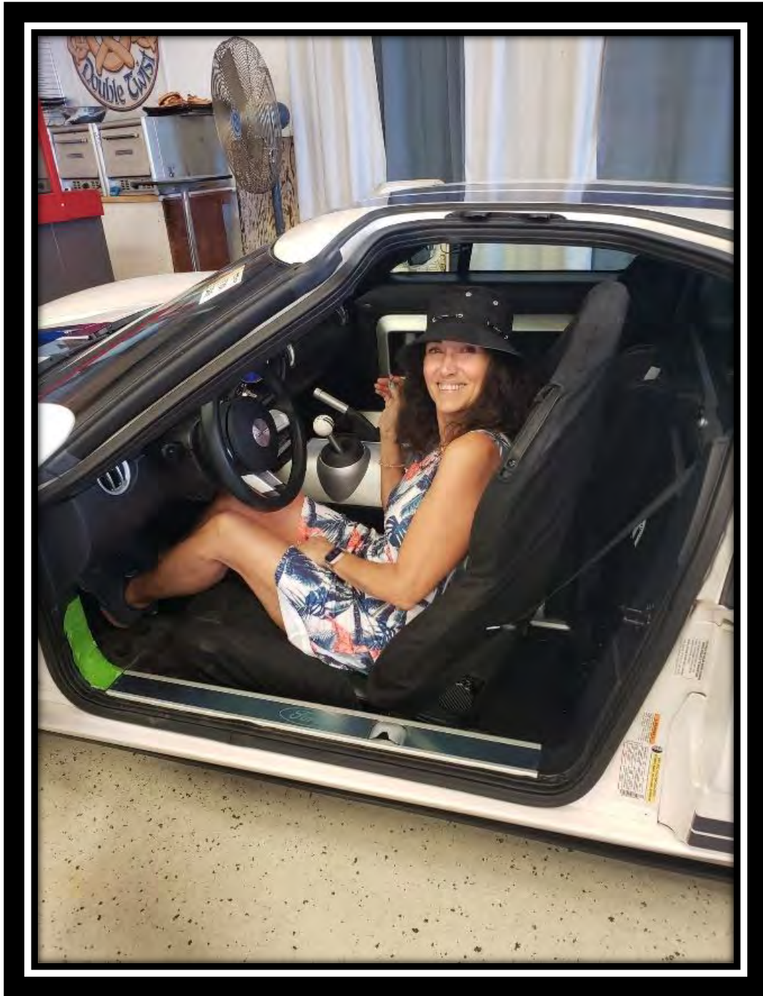
Your editor enjoys some quality time with a Ford GT at the All Ford Nationals at Carlisle