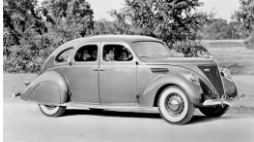
1. 1936 Lincoln-Zephyr