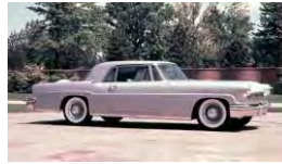
2. 1956 Lincoln Continental Mark II