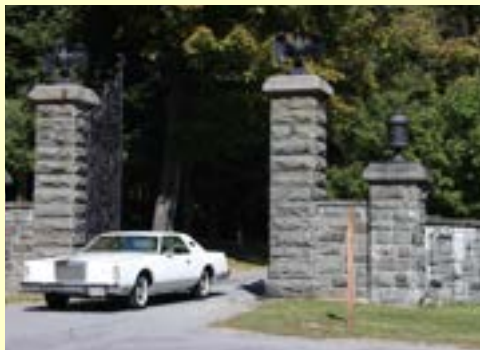
Back exit with the eagle sculptures