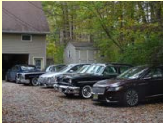
Line up in the Clarkes' driveway of a few nice Lincolns!