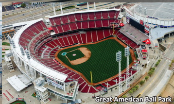
Great American Ball Park