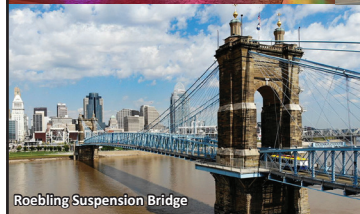
Roebling Suspension Bridge