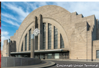
Cincinnati Union Terminal