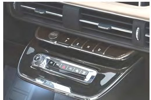
Gear selection buttons, top row. Climate control below.

Set Course And Engage - The biggest new item on the 2023 Corsair is Lincoln BlueCruise. Yes, I said BlueCruise. The hands-free driver-assist system has a new name after a single year under the ActiveGlide banner, and I'm just glad people will stop sniggering when they hear it. I understand Ford and Lincoln's desire to distinguish the premium version of this system from the mainstream (even if the only difference between the two is the vehicle they're attached to) but, generally speaking, names that remind people of bedroom paraphernalia are a bad choice.