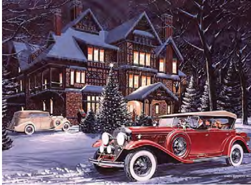
The Welcome Wagon