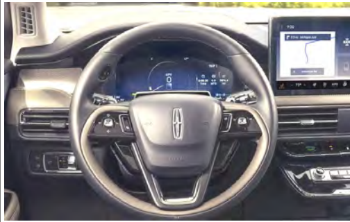
Another look at the Corsair dash.

climate settings at the bottom of the screen, where the page icons for the media, navigation, phone, etc. live on other Sync 4-equipped vehicles, makes the whole system more cumbersome. In order to get from, say, the navigation to the radio page, the Corsair requires an additional input. I also had trouble getting between the native infotainment and the Apple CarPlay interface (wireless connectivity is standard, though).