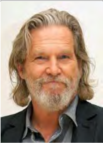
Jeff Bridges American Actor

Jeffrey Leon Bridges (born December 4, 1949) is an American actor. He is known for his leading man roles in film and television. In a career spanning over seven decades he has received various accolades, including an Academy Award, a Golden Globe, and a Screen Actors Guild Award in addition to nominations for three BAFTA Awards. In 2019, he was awarded the Cecil B. DeMille Award.