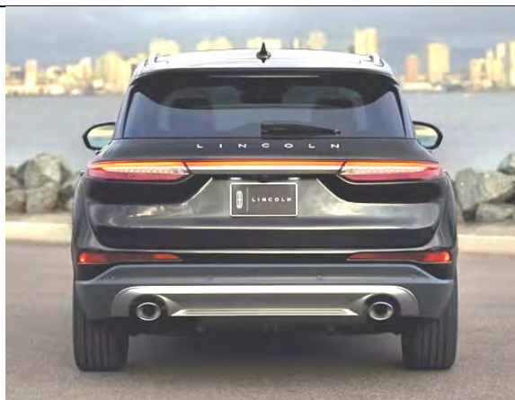
Rear view of the Corsair.