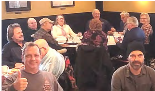
What a fine group we had at Casper's.

Our room was very nice and comfortable and lent itself well to visiting with one another. Casper's is a place where you never get rushed, and there is no urgency to turn over your table for the next customer. It just made for a nice relaxing place for our meal and to celebrate another year with our members.