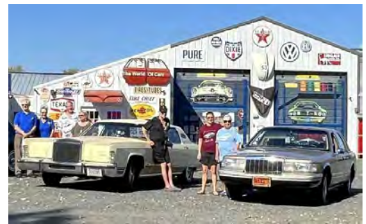
World of Carz, Stanley, Wisconsin.