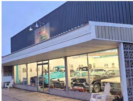
Cody's Classic Cars, Stanley, Wisconsin

Sunday, October 1, was the date for a driving tour and fall leaf viewing at Cody's Classic Cars and World of Carz in beautiful downtown Stanley, Wisconsin. We left Hudson at 10 a.m. and arrived in Stanley at 11:30 a.m. After a week of rain, most of the leaves had lost their brilliant fall color.