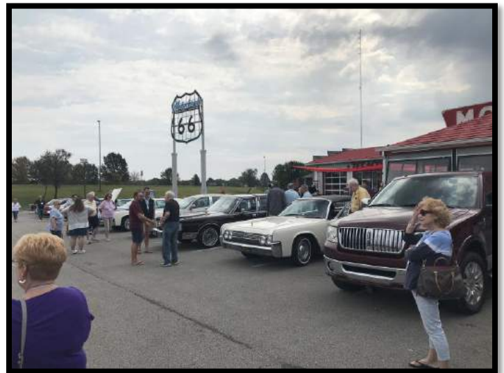
Lunch on Friday at Motorheads Restaurant.