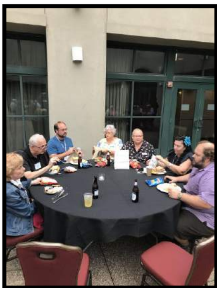
Wednesday Night Early Bird Dinner

Sunday morning, we all said our goodbyes and headed for home, filled with great memories and a sense of fellowship that only a Lincoln Club can provide.