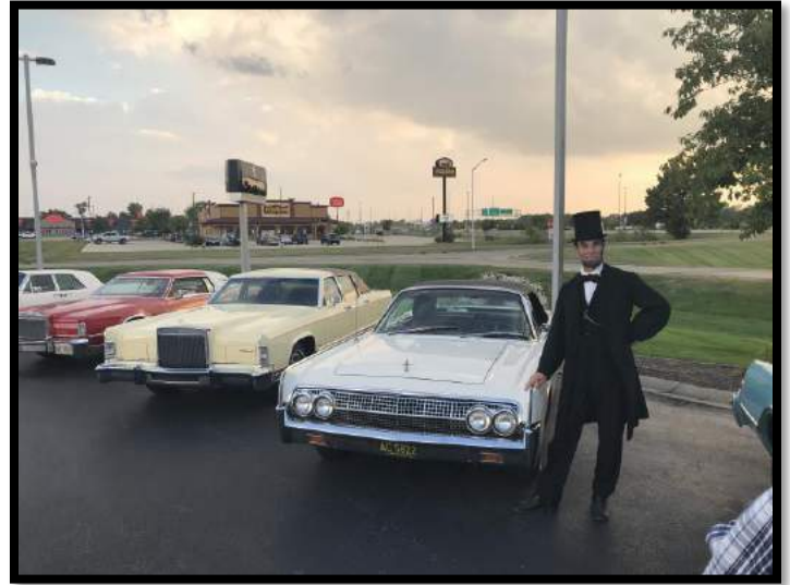
Abe Lincoln checking out the vehicles at the Green Lincoln Event.