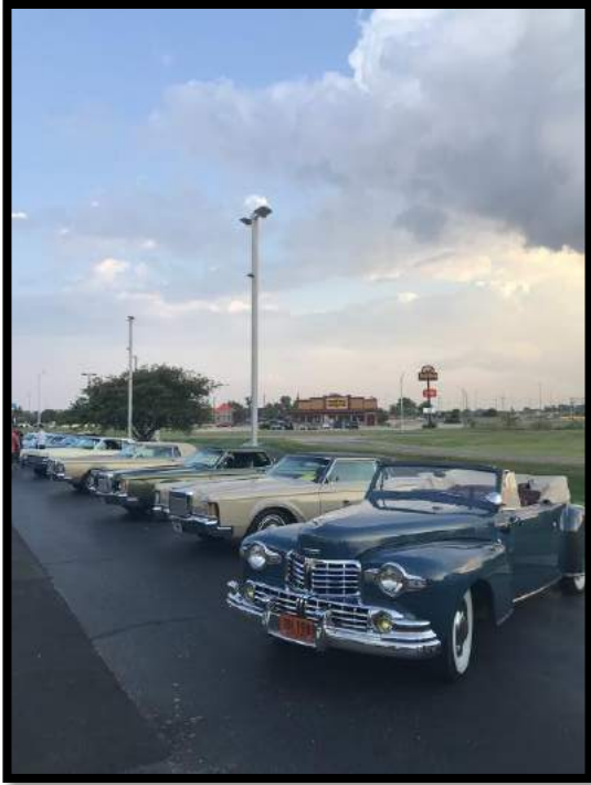
Green Lincoln Event