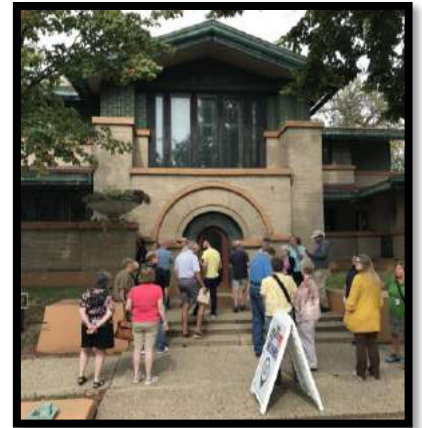
Dana Thomas Home

Activities began for most folks on Wednesday with a bus tour over to the Dana-Thomas House, a Frank Lloyd Wright masterpiece completed in the early 20th Century. The home, both inside and out, was a cohesive mix of classic Prairie Style that was simply amazing. Dinner on Wednesday night was at the top of our hotel, providing a terrific view over Springfield.