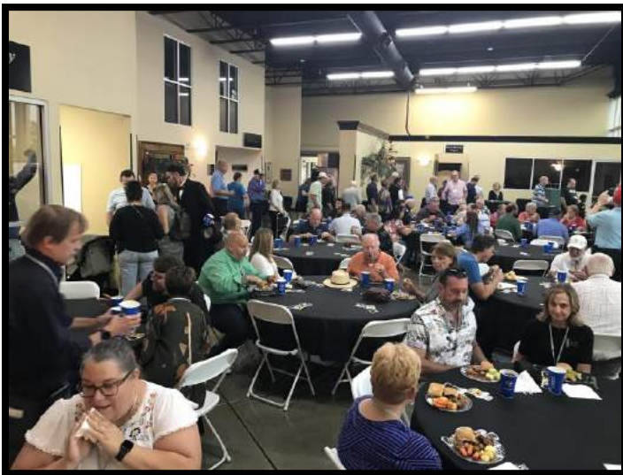
Green Lincoln Event Dinner.