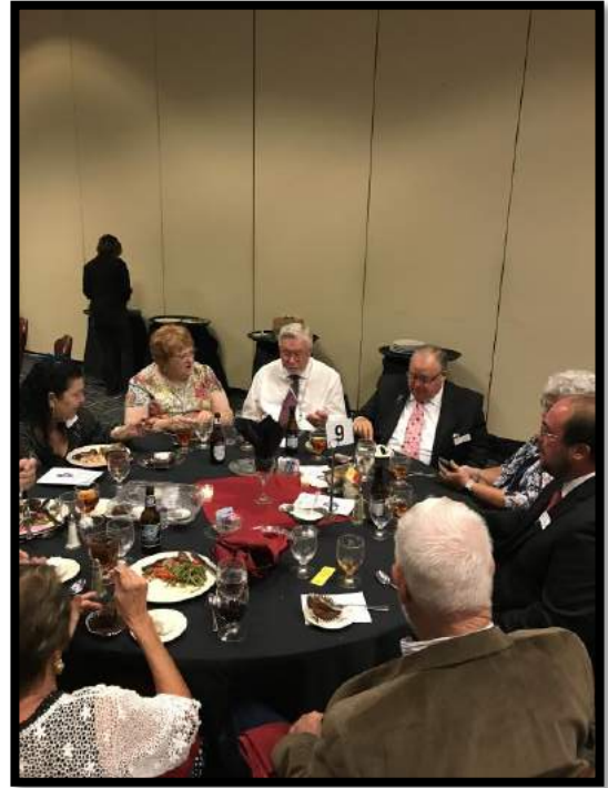
Attendees enjoying the Saturday night awards event.