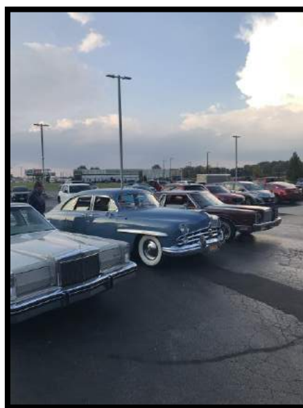
Green Lincoln Event