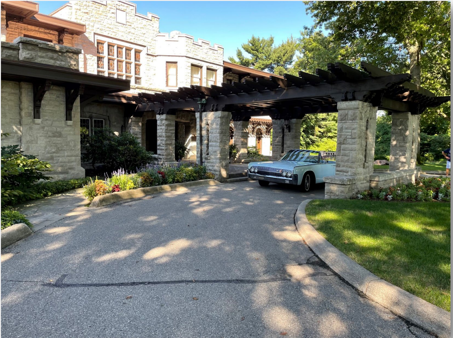
Your faithful Editor's 1962 Lincoln Convertible in front of Fair Lane – the former home of Henry and Clara Ford, Dearborn, Michigan.