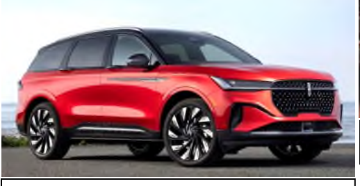
The all new 2024 Nautilus

Sales growth - Despite the industry's pivot to EVs, Craig said gasoline-powered and hybrid models will continue to play an important role for the brand. "As much as we're finally seeing EVs take off, we've been talking about it for 20 years," she said. "And for as many entries that came in, it was never more than 1 or 2 percent of the industry. But 75 percent of customers are still choosing gas or hybrids. Take the next few years; it only goes from 75 down to 65. For the foreseeable future, we're going to see the majority of folks still going for gas and hybrids."