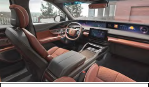
Another view of the Nautilus cabin.

The Nautilus cabin is what Craig and other executives call the "evolution" of that quiet flight theme. It includes a new 48-inch display screen and comes with an optional Lincoln Rejuvenate mode featuring lights, sounds, and smells designed to create a peaceful environment. "We're taking these interiors to a whole new level," Craig said. She said Lincoln must also work to differentiate itself from competitors with new services. "Customers want convenience on their terms," she said. "We have to be uberconvenient to do business with."