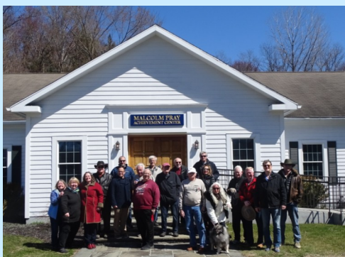
The MAR group