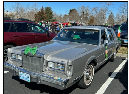
Decorated for St. Patrick's Day Parade