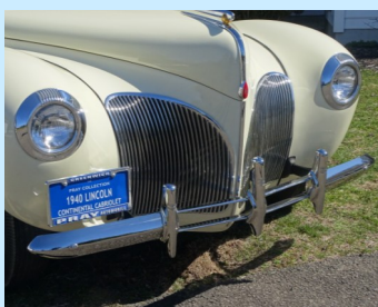
1940 from the collection

The students learned several criteria to consider when taking photos to get the best and most interesting results. To briefly summarize, some ideas noted to keep in mind are to ..... visualize the photograph that you wish to take first. Do not just snap a photo, but take time to plan and study the scene or object first. Look for horizontal or vertical lines that draw your eye/attention. Create balance in the picture with both sides equally weighted in the photo. Remember, sometimes simplicity is best. For instance with an automobile, it can be a detail, an insignia, a wheel, and not the entire car. Lastly, if you mentally divide the screen into thirds with intersecting lines, put the most interesting detail at one of the corners of these imaginary intersections. It can make for a more dramatic photo.