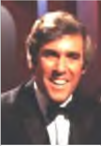
Burt Bacharach American Composer 1928 - 2023

Burt Freeman Bacharach ( May 12, 1928 - February 8, 2023) was an American composer, songwriter, record producer, and pianist who is widely regarded as one of the most important and influential figures of 20th-century popular music. Starting in the 1950s, he composed hundreds of pop songs, many in collaboration with lyricist Hal David. Bacharach's music is characterized by unusual chord progressions, influenced by his background in jazz harmony, and uncommon selections of instruments for small orchestras. He arranged, conducted, and produced much of his recorded output.