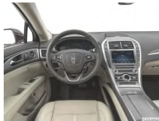
A "behind the wheel" view of the 2019 MKZ dashboard.

2013 MKZ concept car was unveiled at the 2012 North American International Auto Show.