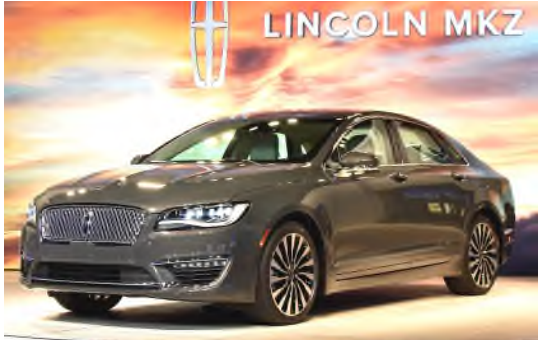
Shown, a 2019 Black Label MKZ

Welcome to the Northstar News, the monthly publication of the Northstar Region of the Lincoln and Continental Owners Club. We value your opinions and appreciate your input concerning this newsletter and the operation of the club. This is your club.