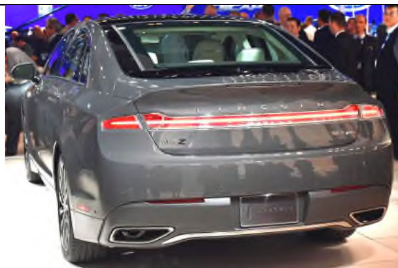
2019 Lincoln MKZ Rear View, simple but elegant