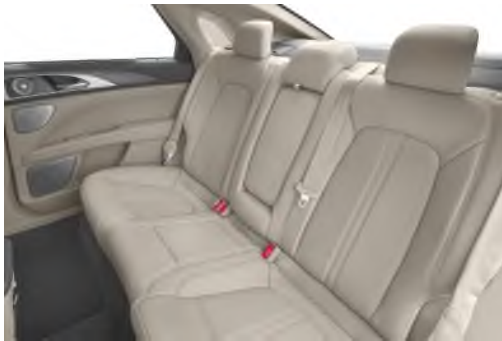
Rear seat interior of the 2019 MKZ

The MKZ was originally set to be released in November 2012, but this was set back to January after Fusion production was delayed, which is produced at the same plant. Its release date was again pushed back after Ford looked to iron out any possible quality issues. Some MKZs were even shipped from the Mexican facility to Ford's Flat Rock plant to be reassured and inspected that they were ready to be sent to dealerships. This was an unprecedented move for such a big product launch, but Ford felt it would be profitable in the long run. Cars finally started to reach dealerships in sufficient quantities by mid-March 2013.