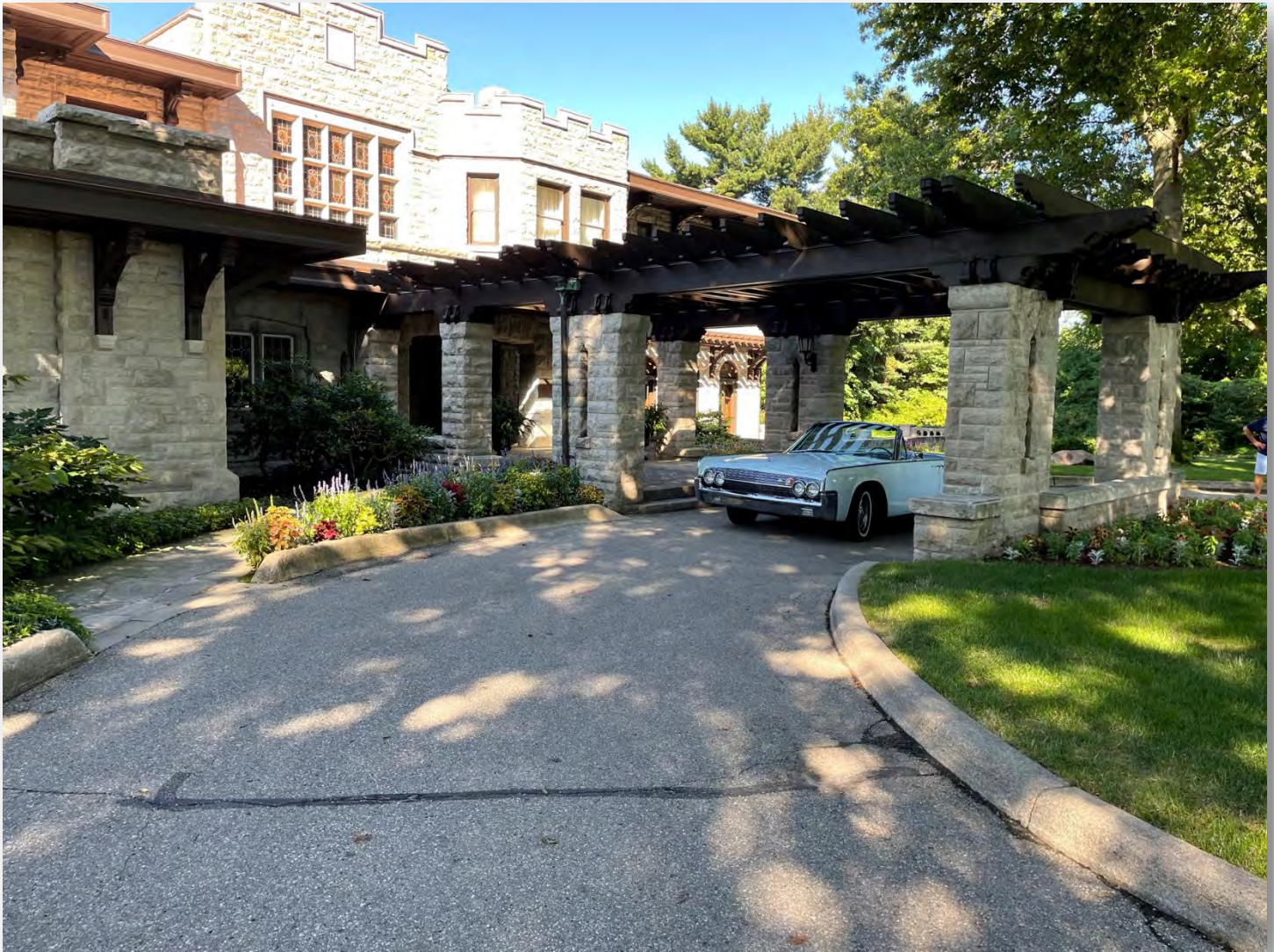
Your faithful Editor's 1962 Lincoln Convertible in front of Fair Lane – the former home of Henry and Clara Ford, Dearborn, Michigan.