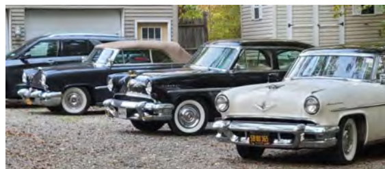
The car show continues at the Clarkes