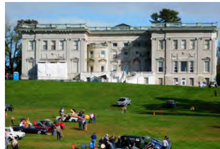
House tours were available at the show