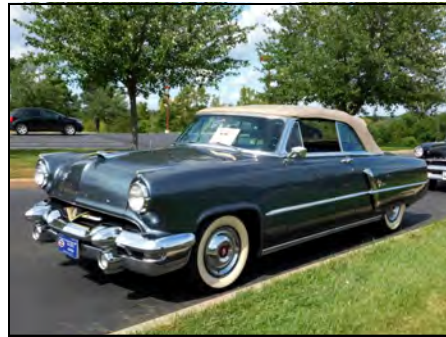
Dan Bush's 1953 Oxford Gray Capri at RRLR. Its notable horsepower with its four-barrel carburetor enabled a good trip up from NJ.

principallinda@msn.com 68 North Cross Road Staatsburg, New York 12580