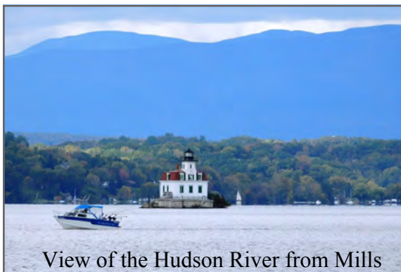
View of the Hudson River from Mills