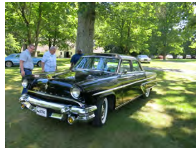
Jim Dunn's car in Windsor, CT

principallinda@msn.com 68 North Cross Road Staatsburg, New York 12580