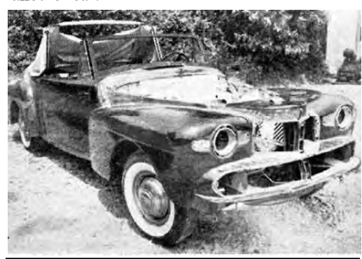
A very sorry looking Continental is awaiting the next stage of the restoration and modification.

Parts from more than thirty different makes and models found their way into the car. The heater is from a Hudson, the fan belt is from Studebaker, fan and window lifts are from Cadillac, fan shroud is from Buick, wheel bearings and backing plates are from Lincoln. In short, almost every moving part in the car is composed of a stock unit from another car.