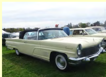
Yellow seemed to be the predominant color of the day! Two beauties!