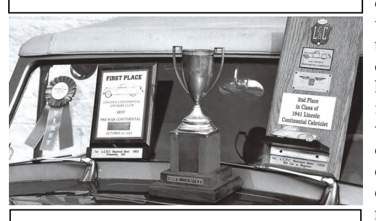
Close up of the trophies.