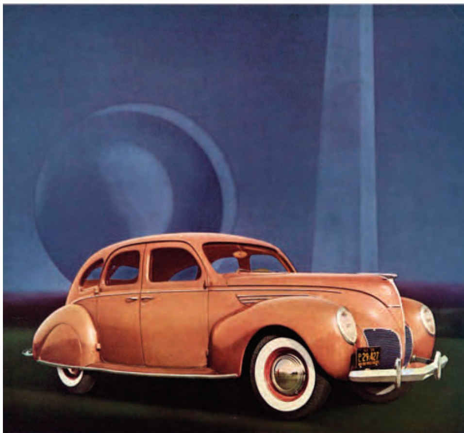
Illustration courtesy of Ford Motor Company, 1935