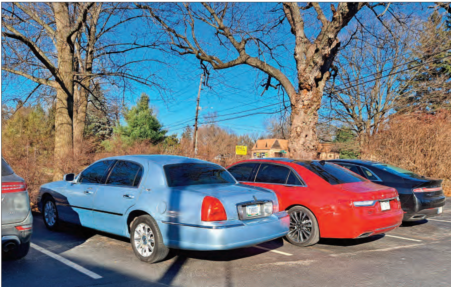
4 Lincoln Log Spring 2022