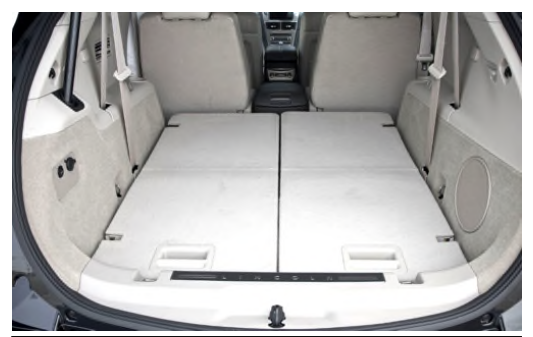
With the third row of seats down, there was a lot of room in the rear of the MKT.

Pricey, but Impressive - At $49,995, the MKT with EcoBoost is not cheap, but the price is competitive with or less than that of most V-8-powered three-row luxury crossovers. This model's amount of standard equipment is extensive and is shared with the base MKT, which starts at $44,995 with frontwheel drive and a 268-hp, 3.7-liter V-6. (We didn't get to sample that model.) All-wheel drive adds another $1995 to the base sticker, but at that point we'd recommend stepping up to the EcoBoost with its additional 87 hp and specific content. We're looking forward to a more extensive test, but we don't need track numbers and hundreds of miles to know that this is one of the most surprisingly competent Lincolns we've sampled in a long time.