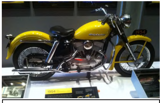
1954 Harley V Twin

day, Saturday, and Sunday. The link to the hotel reservation site is <a href="www.my-event.hilton.com/">www.my-event.hilton.com/</a> <a href="mailto:mkeccdt-lco-0b21e75a-6689-45ce-873d-29ceb1964896/">mkeccdt-lco-0b21e75a-6689-45ce-873d-29ceb1964896/</a>, and we will spend all three nights there, so there is no need to repack until we head home. There will be reserved parking for our collector cars, which also will have an area where you can wash your car if you choose. Valet parking is also provided. The hotel has a very nice bar and restaurant. After the long trip, we will meet at 5 p.m. at the bar for afternoon libations, followed by dinner at their restaurant.