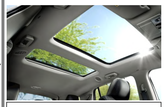
Most MKTs were equipped with the optional sun roof package. Lots of glass overhead.

The MKT featured electric power steering over more-traditional hydraulic power steering. The electric steering system is combined with ultrasonic sensors to form a handsoff "Active Park Assist" system that steers the vehicle into parallel parking slots.