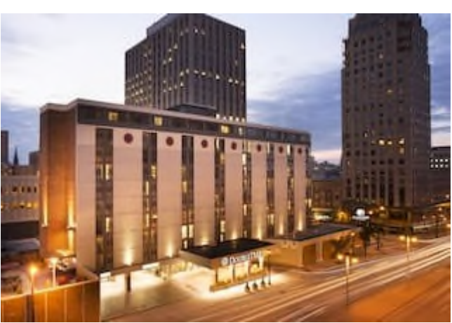
Milwaukee Double Tree Hotel

Meet in the morning for breakfast at 9 a.m. After a leisurely visit with good friends over that second cup of coffee, we will bid adieu to the great city of Milwaukee, and then, head on home with a lot of great memories.