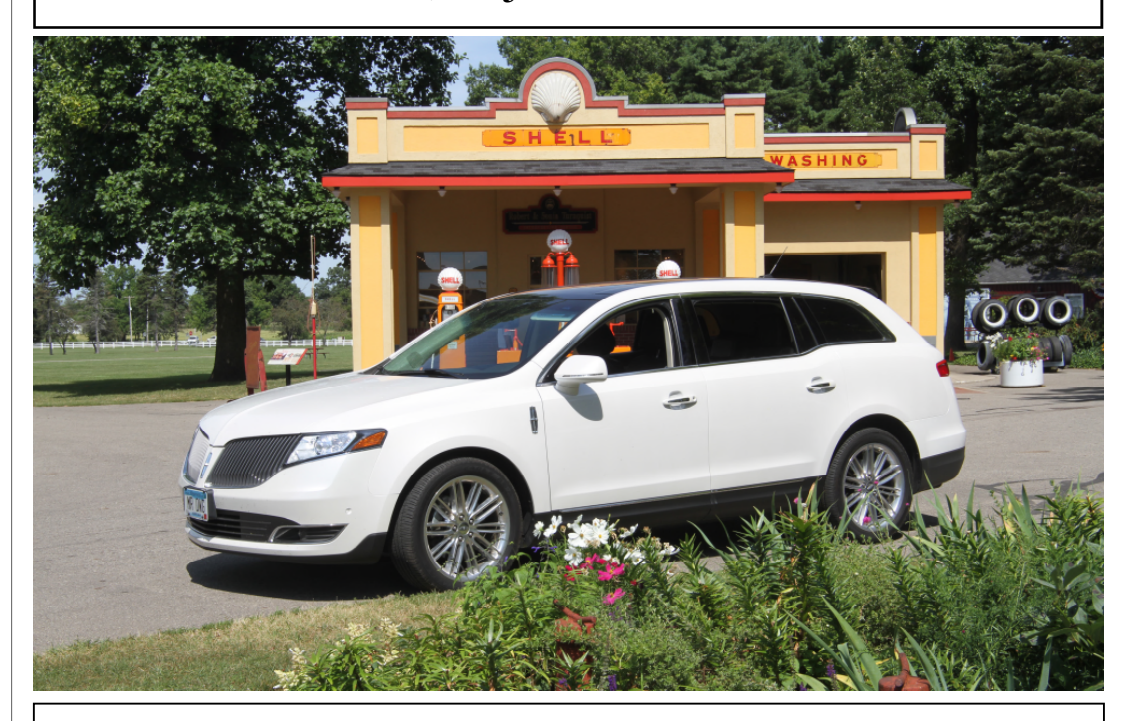
Your editor's MKT at Hickory Corners, Michigan

Welcome to the Northstar News, the monthly publication of the Northstar Region of the Lincoln and Continental Owners Club. We value your opinions and appreciate your input concerning this newsletter and the operation of the club. This is your club.