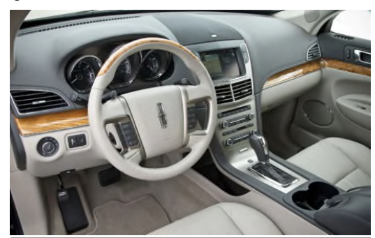
Lincoln MKT dash and front seat area.

made it possible to extend production for a longer period than would be normally expected.