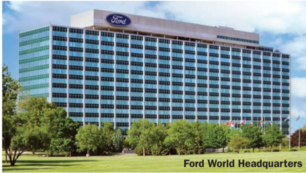
Ford World Headquarters