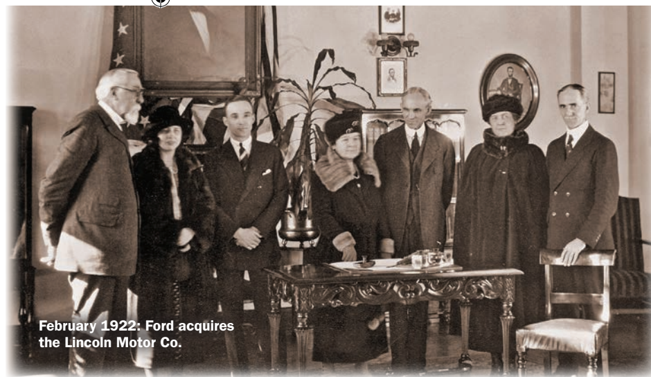
February 1922: Ford acquires the Lincoln Motor Co.

The big day will be Saturday, with a concours-style display of all our classic Lincolns on the lawns adjacent to the Lincoln Motor Car Heritage Museum. Members of all four Lincoln clubs will have cars on