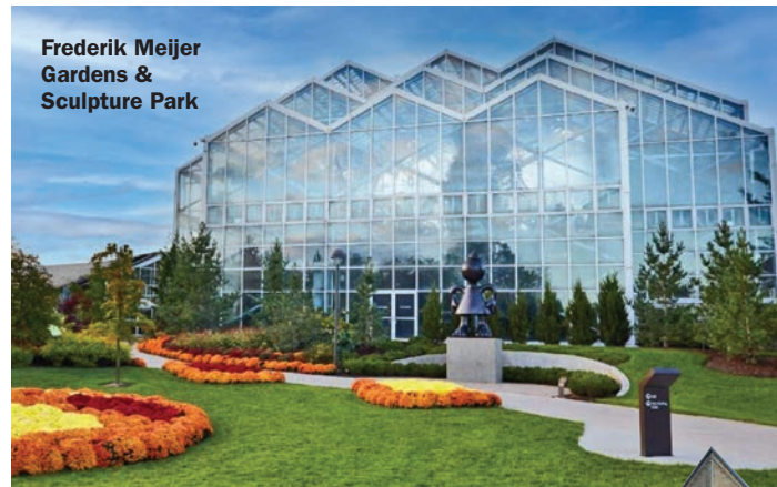
Frederik Meijer Gardens & Sculpture Park