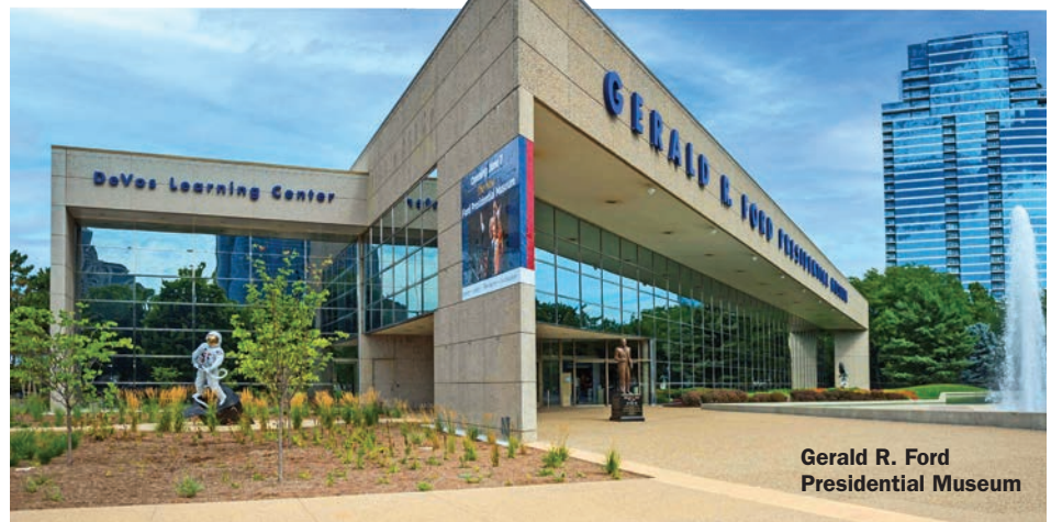
Gerald R. Ford Presidential Museum