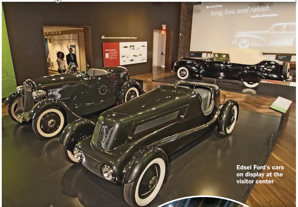
Edsel Ford's cars on display at the visitor center