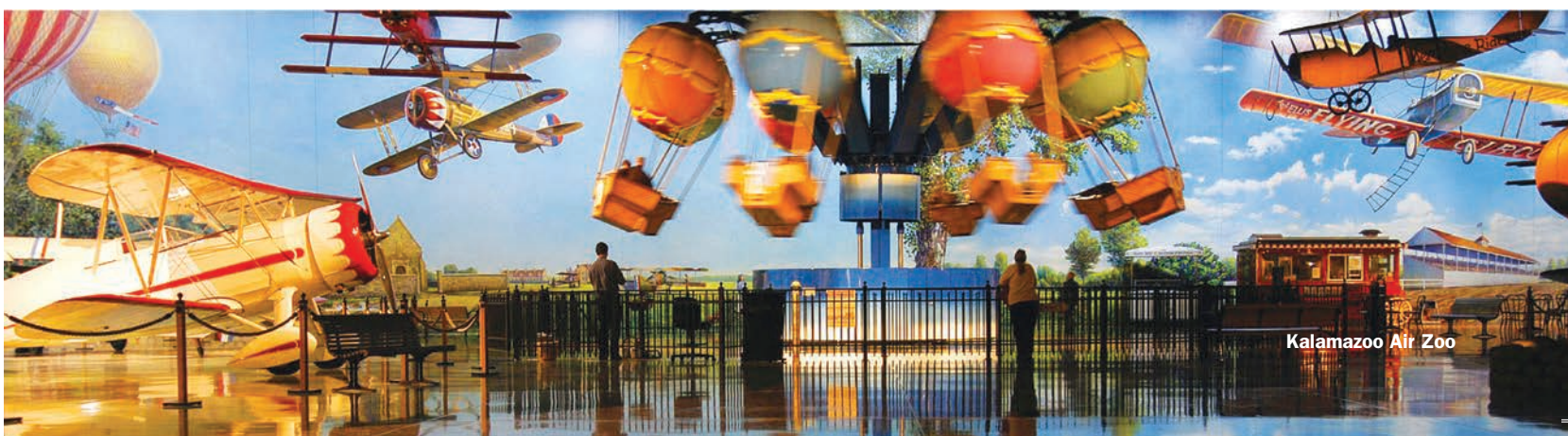
Kalamazoo Air Zoo