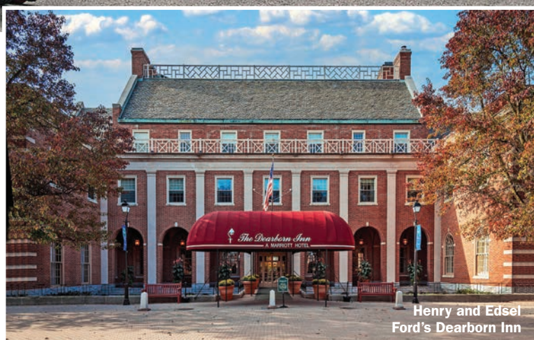
Henry and Edsel Ford's Dearborn Inn