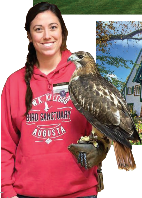
Guests can wander the expansive wooded grounds of the grand lakeside estate of the W.K. Kellogg Manor House; nearby is the Kellogg Bird Sanctuary.