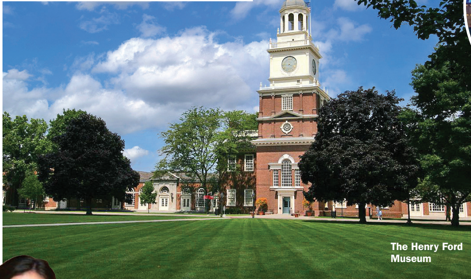
The Henry Ford Museum