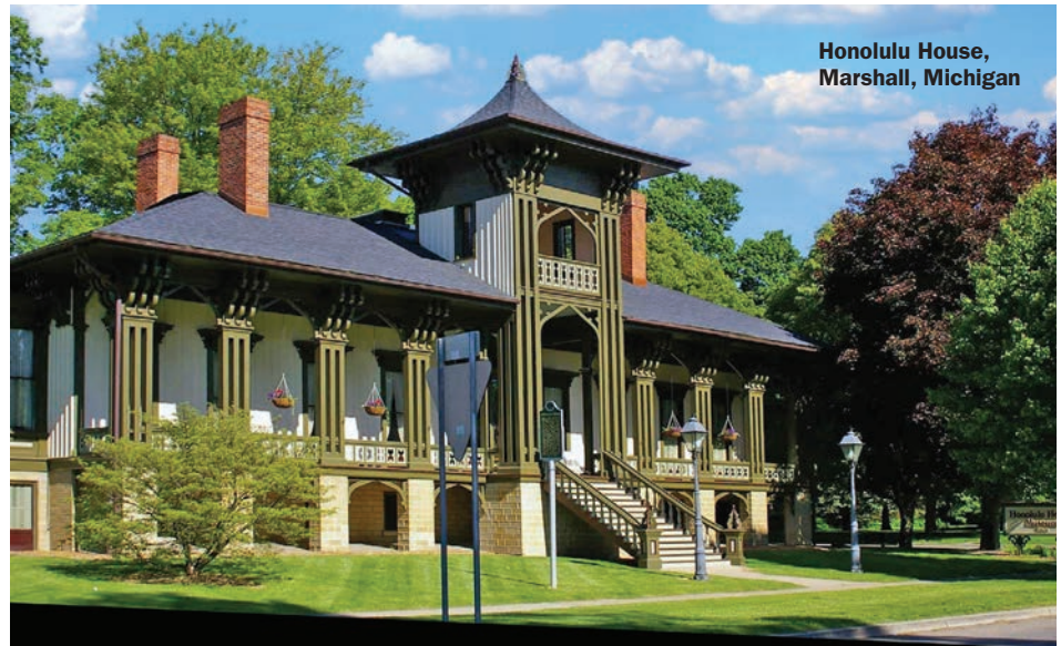
Honolulu House, Marshall, Michigan

Another driving tour will take participants to nearby historic Marshall, Michigan , which features unique architecture throughout the city as well as a unique downtown that includes