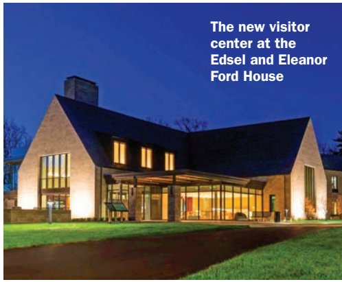
The new visitor center at the Edsel and Eleanor Ford House