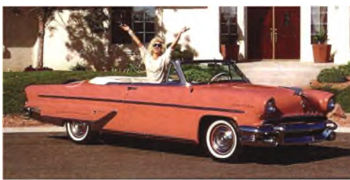
Marilyn Monroe's 1955 convertible

There is a 1955 Lincoln convertible called the "Sportsman" because it has wood trim like the old 1946-48 Ford and Mercury Sportsman, but there is no evidence that this car was ever a Lincoln styling exercise. Reportedly, five of these 1955 Lincoln convertibles were built for the show circuit, and one or two have turned up at collector car auctions. The body is not all wood as in the 1946-48 cars. It is applied over metal surfaces.