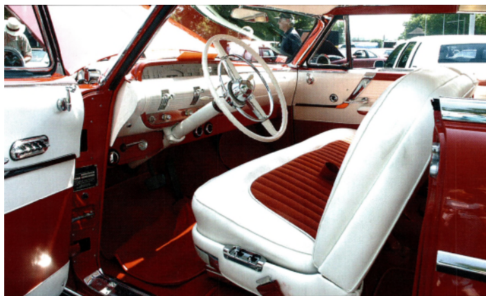
Palmer's 1955 Capri interior.