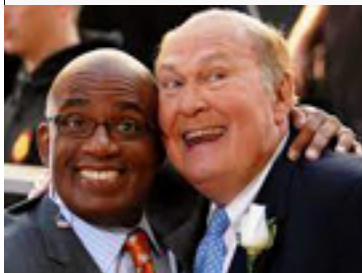
Willard Scott with his successor Al Roker (left).