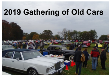
Save the date 10/17/21