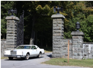
Mills Estate Exit

It was an exceptionally pretty fall day and we thought of all the past years we have gathered in our Lincoln line at Mills. We will hope for a great day on October 17 '21.