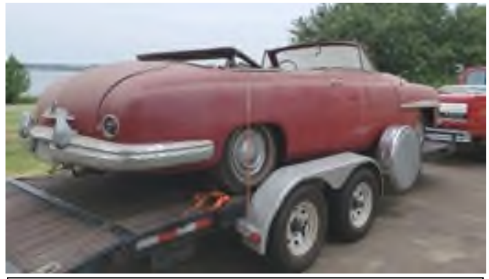
A somewhat sad-looking Cosmopolitan going home

Inside was parked a bright red '1949 Lincoln convertible. I had never seen a Cosmopolitan until this day, and the moment I laid eyes on the convertible, I absolutely fell in love. The red, still glossy under the dust. 337 Flathead V8 with a 3 Speed Man-