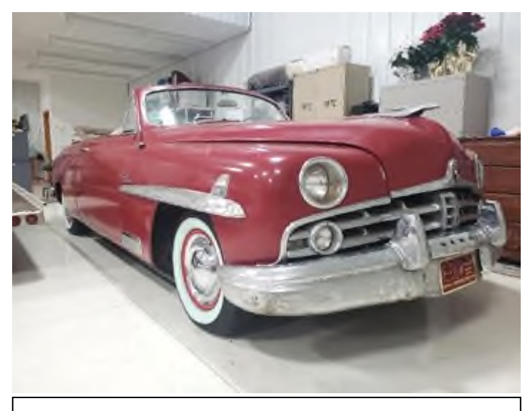
Nels Wood's very rare 1949 Lincoln Cosmopolitan