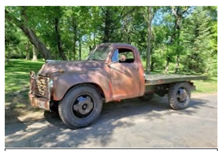
A proper work truck is this 1949 Studebaker; a 1-ton pickup also occupies space in Nels garage.

My 1949 Lincoln is actually my second classic vehicle. I also have a '49 Studebaker 2R-15 (1 ton) pickup truck that I purchased down in Kansas. I rebuilt the original hi-torque brake system, wired the engine, full tune-up, and built a flatbed. It's a great little truck and fires right up. I enjoy working on these older cars and am currently trying to save up for my own little dealership/repair shop now that I am done with school. I work on classics whenever I can. I'm hoping the club will have some members who need their cars repaired. I have a truck and trailer, so loading/delivery isn't an issue. I also have a garage at home, which I can work out of with ample space. I graduated this May from WITC in New Richmond, WI, with an associate degree in diesel mechanics. I also previously spent two years at the restoration school of McPherson College in McPherson, Kansas.