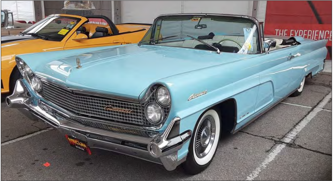
Top 1959 Lincoln Continental Mark IV Convertible. Right 1960 Lincoln Continental Mark V Sedan.