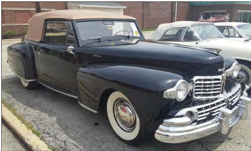
Above 1955 Lincoln Capri Coupe. Left 1948 Lincoln Continental Cabriolet.

warm feeling to it, so I make it a point to spend a day or two on-site when the auction comes to town.