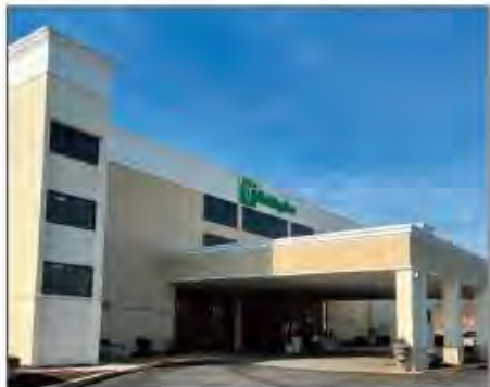
The Lincoln Log

The 2021 Eastern National Meet of the Lincoln & Continental Owners Club will be hosted by the Philadelphia Region Oct. 20-24, 2021, in Morgantown, Pennsylvania. The meet will be held indoors at the Classic Auto Mall, which is connected undercover to the Holiday Inn in Morgantown. This means no weather concerns! The meet will be held rain or shine. The Holiday Inn is providing our Lincoln membership with upgraded suites, including a full breakfast each day. For those interested in making early reservations, the phone number of the Holiday Inn is 610-286-3000. We've arranged for a discounted