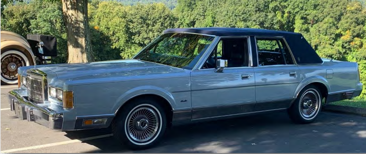
Jim Cappello's 1989 Town Car photographed at the LCOC Eastern National Meet at Hyde Park, NY back in September 2019. Jim received a Primary first place and a Lincoln trophy.