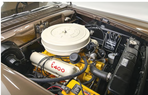
Exclusive to the Edsel line, this Bermuda was equipped with a 361 cubic inch engine.

Then there is the beautiful 1958 Edsel Bermuda Wagon (Lot 1341.1), a rare gem known as "Edsel's Edsel." Modified and restored by Roush in 2016, the single-production-year Bermuda represents the top-of-the-line station wagon offered by Ford Motor Company's bold but short-lived, mid-tier Edsel marque. Under the hood is the Edsel-exclusive 361-cubic-inch "E-400" V-8, named for its impressive output of 400 lb-ft of torque. Fed by a four-barrel carburetor and boasting a 10.5:1 compression ratio, the V-8 makes 303 horsepower.