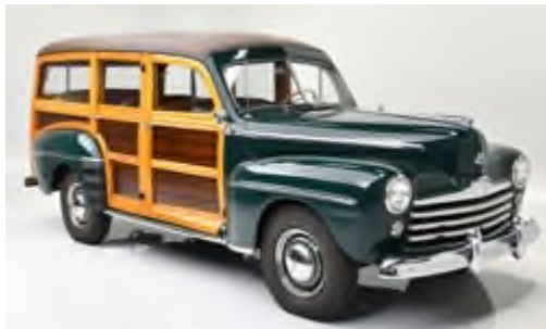
Edsel Ford's 1947 woody wagon