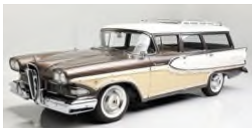
Edsel Ford's 1958 Bermuda Wagon