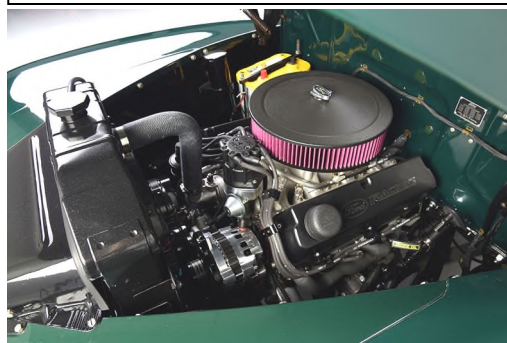
A very modern Ford 302 engine makes for a great running 1947 woody wagon.