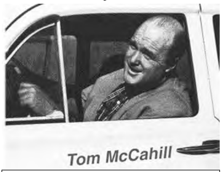
Noted automotive writer, Uncle "Unk" Tom McCahill.

I hadn't been to Detroit in 10 years, and I had forgotten how much the streets get beat-up from those cold winters. Asphalt doesn't like big temperature changes. It gets brittle when it's cold, and it doesn't like to be hammered by cars and trucks with chains and studded tires. Choppy, potholed roads didn't bother the Lincoln Mark VIII. That air suspension just smoothed out everything. The computer-controlled suspension just soaks up the bumps and potholes, but when you throw the car into a corner, the computer instantly responds and stiffens everything up so that the Mark doesn't wallow and thrash around. Tom McCahill would have said that the VIII was as "smooth as a vanilla ice cream soda that's been standing in the sun."