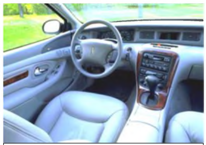
The Mark VIII features a nice, well organized dash layout. Everything needed is within close reach by the driver.

The Mark II is a pretty quiet car for a '50s hardtop, but the vent windows and lack of door pillars make it hard to prevent wind noise at freeway speeds. Turn on the Mark II's Town and Country radio, and all you'll get is AM - after the vacuum tubes warm up. The 6-way power adjust seats in the Mark II are very comfortable for me; we've taken lots of long trips in ours, and the seats feel as good after eight hours as they did when I first got in. The Mark VIII has about-37-way power adjusting seats. I certainly liked them, and I think they can be adjusted to fit just about any driver. We didn't take the Mark VIII on any long trips but, if we did, I bet they'd still feel great 10 hours after we started. Mr. McCahill would have likened the VIII's seating comfort to "a wheelchair upholstered in cream puffs."