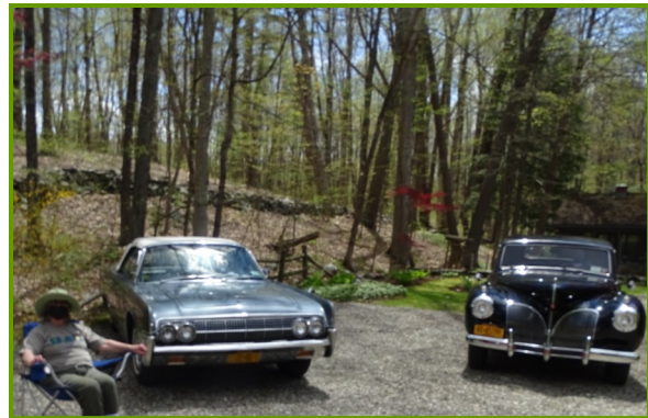
The Rhinebeck Show ????????

principallinda@msn.com 68 North Cross Road Staatsburg, New York 12580