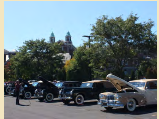
At the CIA