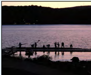
Along the Hudson River at the Rowing Association Boathouse

principallinda@msn.com 68 North Cross Road Staatsburg, New York 12580