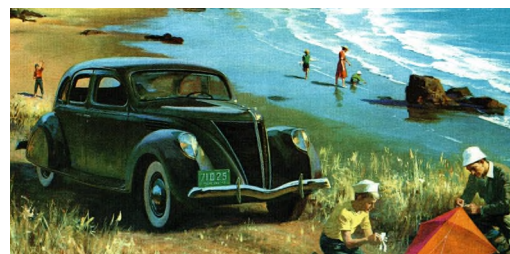
The painting above recalls those innocent times of the mid-30s. It comes from the May, 1973 Exxon calendar.

Where were you in 1936? Most of our members were not even born. If you do remember 1936, you would now have to be at least 85 years old.