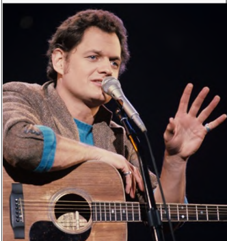
Harry Chapin American Singer 1942 - 1981

Harry Forster Chapin (December 7, 1942 - July 16, 1981) was an American singer-songwriter and philanthropist best known for his folk-rock and pop-rock songs.