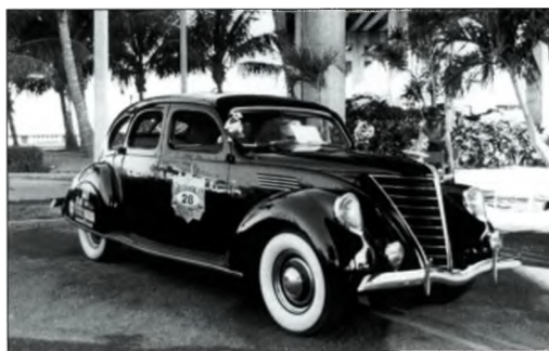
Jack's car pictured at the Eastern National Meet in Ft. Myers, Florida in 1998.

The motor was, of course, the tip of the iceberg. In addition to considerable detailing in the engine compartment and undercarriage, the car was converted back to original, and most of the non-authentic parts were replaced. The car was shown at the Millennium Meet and at the LZOC Tidewater Meet. We still hope to drive it on some major tours.