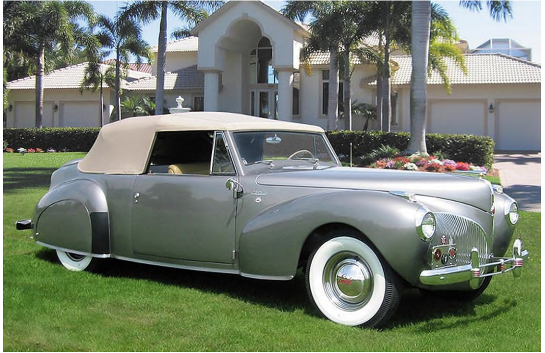
One of the most photographed and admired prewar Lincoln Continentals

Welcome to the Northstar News, the monthly publication of the Northstar Region of the Lincoln and Continental Owners Club. We value your opinions and appreciate your input concerning this newsletter and the operation of the club. This is your club.