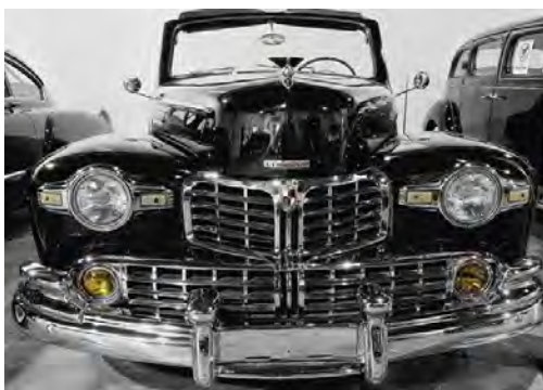
The 1947 Continental has a massive, but elegantly styled front end.

Over the years, the front spring has tended to settle in most Continentals, giving them a lower look in the front than was originally intended, but many of their owners prefer this. Those transverse springs really hold down the braking dip, by the way; it was only 1-1/2 inches - about as low a dip as any of our tests have ever recorded.