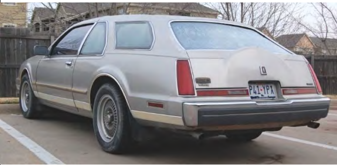
Mark VII Welcome Wagon