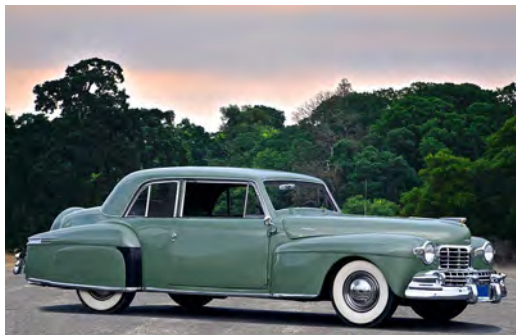
The Continental has such fine styling that it truly has endured the test of time.

Now there are enough fancy words to satisfy any queen.