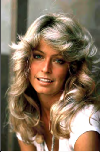
Farrah Fawcett-Majors 1947 - 2009 American Actress

Farrah Leni Fawcett (February 2, 1947 - June 25, 2009) was an American actress of stage and screen, model, and artist. A five-time Emmy Award nominee and six-time Golden Globe Award nominee, Fawcett rose to international fame when she starred as private investigator Jill Munroe in the first season of the television series Charlie's Angels (1976-1977).