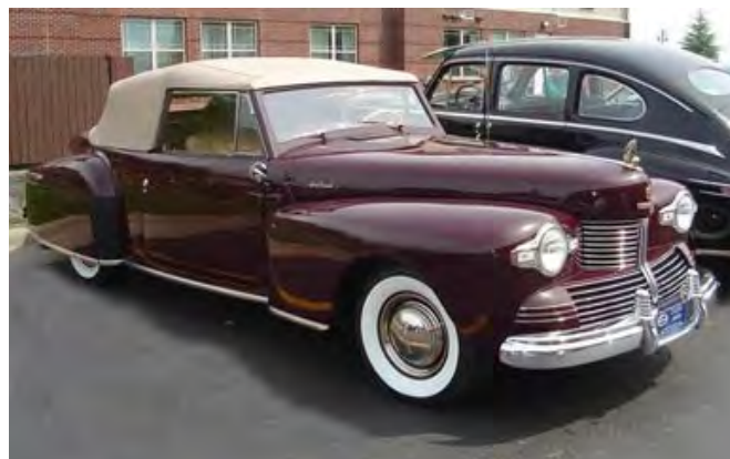
Another view, Roger Wothe's '42.