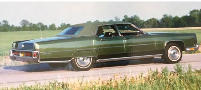
Bill's $100 Lincoln, not a bad buy!

Many years ago, when it was still possible to buy older cars for almost nothing, I saw a dealer ad in the local shopper for a '73 Lincoln, bad motor, $100. Irresistible! My friend, Dave Bauman, took me in his Pontiac to see the car, with a tow chain in the trunk, just in case.