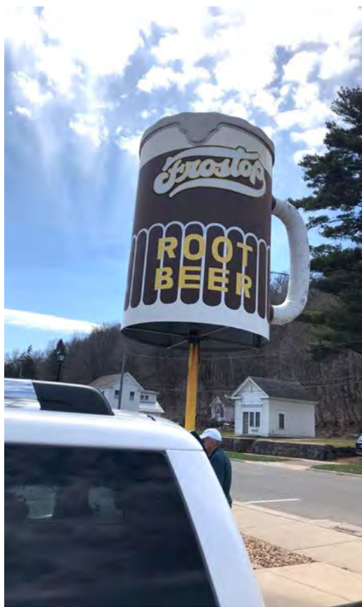
Like a big magnet, this sign pulls us into the Taylor's Falls Drive-In.