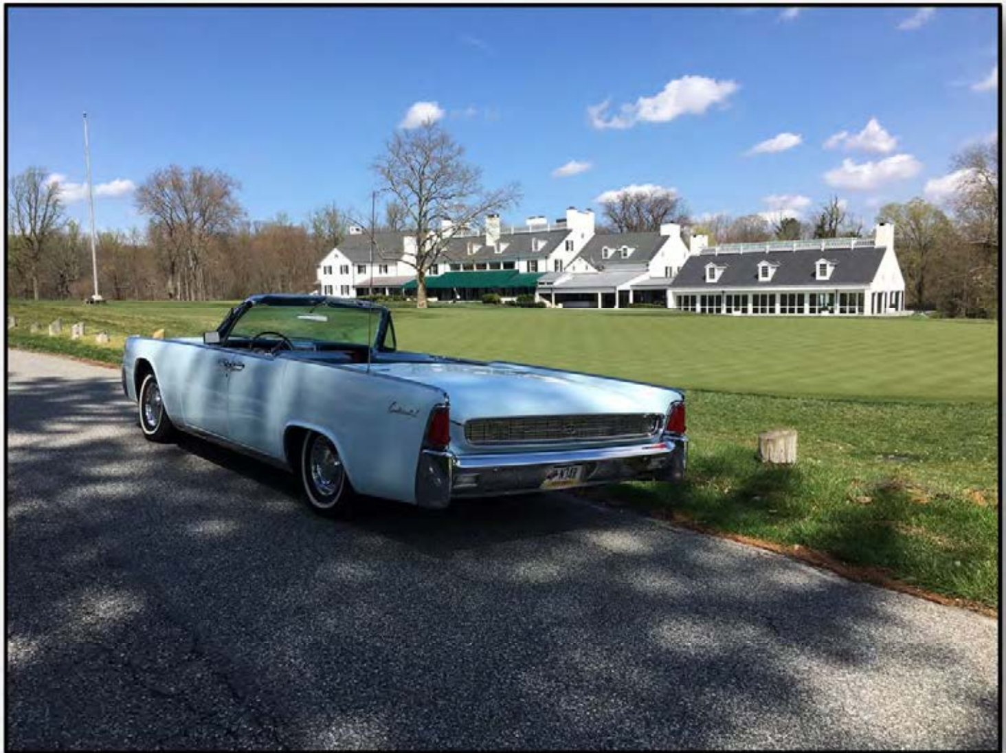
The Editors' 1962 Lincoln Continental Convertible in front of the Merion Golf Club, Ardmore, PA.