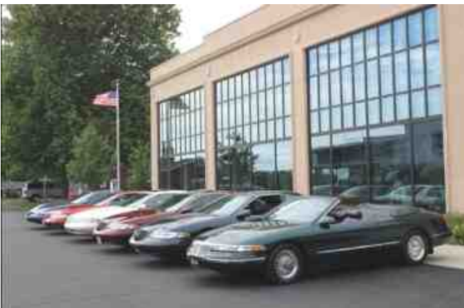
There were eight Mark VIII at Hickory Corners, here are six of them lined up in front of the museum. The first one, a nice dark green in color, is a custom convertible.