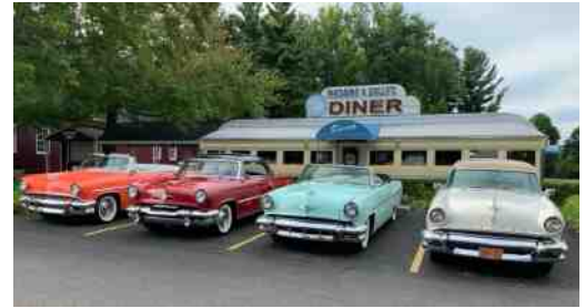
Classic Road Race Lincolns in front of George and Sally's at Hickory Corners.