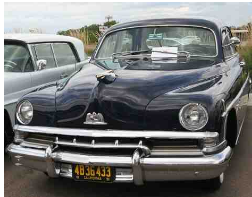
1951 Lincoln Cosmopolitan, best of show

People's Choice Awards were given out at the end of the show for the three cars; which did their best to capture the hearts of those who attended.