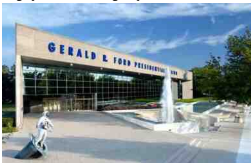
Gerald R. Ford Museum