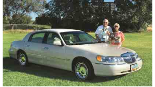
Another view of a great couple with their exceptional Town Car.