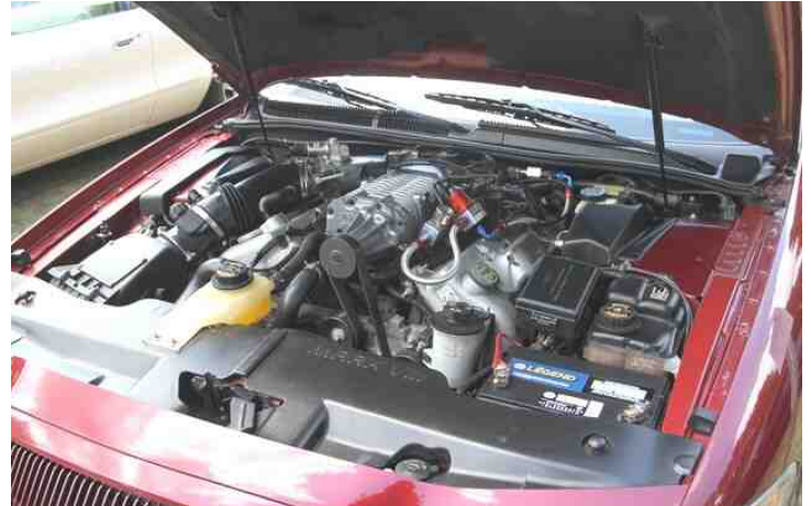
Not your typical Mark VIII, this one features a belt driven super-charger, which makes the Mark VIII, normally a quick car, even quicker. Several of the Mark VIII at the show were supercharged.