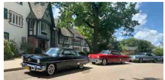
Lincolns at the Kellogg Manor House

The Road Race Lincoln Register hosted 2019's Lincoln Homecoming August 7 through the 12th, 2019. The decision was made early on in the planning that we wanted to change it up this year by inviting all Ford products to the show. We welcomed 125 members and their families from all four Lincoln clubs plus Ford, Edsel, and Mercury for this first time event featuring all Ford-built automobiles. All in all, the event was a success; however we were a little disappointed in the turnout of non-Lincoln cars. The non-Lincolns that did show were high quality and pretty diverse. While many of us arrived Monday to help set up registration and get organized for the week's activities, Wednesday was when our first event took place. Some of our group drove out to the Gilmore Museum for their weekly cruise night. There was a large turnout of local cars of all types and ages, and the evening was perfect! Those that choose to stay at the hotel got to enjoy a welcoming party with free appetizers and a cash bar.