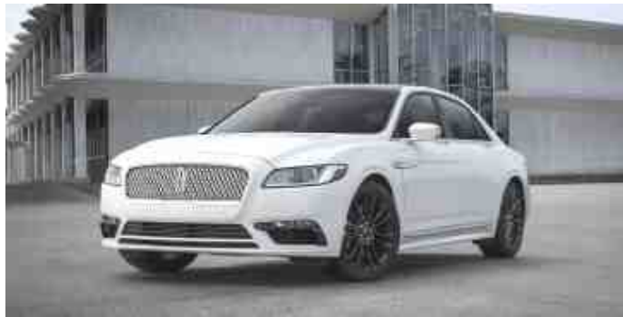
Above, understated elegance, the Lincoln Continental. Below, the perfect sized SUV, the new Lincoln Nautilus.

DEARBORN, Michigan, Sept. 12, 2019 – Lincoln Continental and Lincoln Nautilus continue to impress and meet the discerning expectations of luxury clients. Based on owner feedback, Lincoln Continental has earned best-in-class honors for luxury cars in AutoPacific's 2019 Ideal Vehicle Awards while Lincoln Nautilus takes the top spot among executive luxury SUVs.