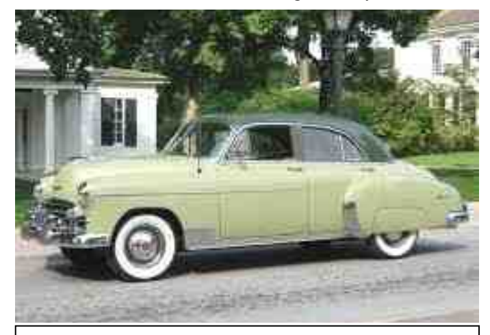
File photo of a 1949 Chevrolet DeLuxe four door sedan. Similar to the model owned by the Freiberg family and used for their daily transportation. Not a bad looking car.

The following is a story based upon childhood memories by member Bruce Freiberg. The family car provided to be a great source of both enjoyment and aggravation for all family members. We thank Bruce for sending this story to us.