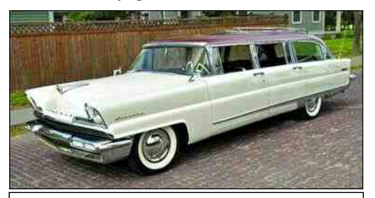
The very elusive Welcome Wagon, caught on camera in Willmar, always on the lookout for new members.