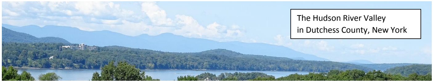
The Hudson River Valley in Dutchess County, New York

Friday night's buffet is at a scenic spot. Thanks to one of our MAR members, we were able to reserve this night at a local, private club where there is very good catered food, a great view of the river and room to display our fabulous auction items. Dress is casual. Just come ready to eat and stay to bid. (Remember to bring any auction items that you have to donate to the registration table when you first arrive at your hotel. The auction is the major fundraiser to support the Meet and your contributions are greatly appreciated.)