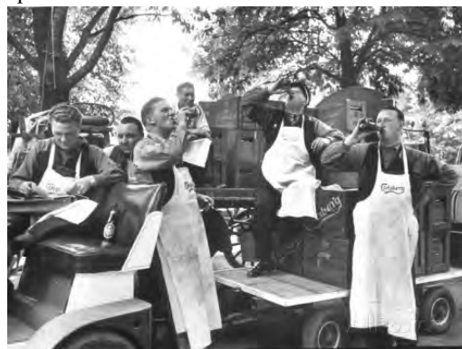
Brewery employees taking advantage of one of the great perks, free beer at lunchtime.