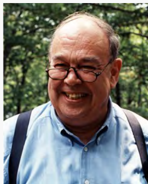
Charles Kuralt 1934 - 1997 American Storyteller

Charles Bishop Kuralt (September 10, 1934 - July 4, 1997) was an American journalist. He is most widely known for his long career with CBS, first for his "On the Road" segments on The CBS Evening News with Walter Cronkite, and later as the first anchor of CBS News Sunday Morning , a position he held for fifteen years.