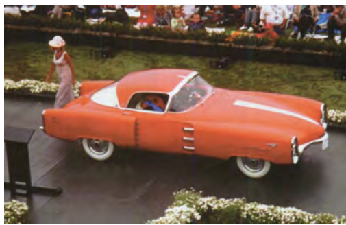
The Lincoln Boano Coupe at the 2001 Pebble Beach Concours.

This article written by LCOC Editor Emeritus was featured in Comments, the November-December 2002 issue. We hope you enjoy reading it.