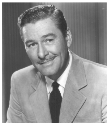
Errol Flynn was the first owner of the Boano.