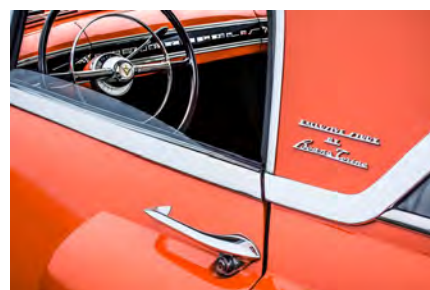
Inscription on panel reads: Exclusive Study by Boano Torino

tional, the front ones to release engine heat and the rear ones to cool the rear brakes. The full wheel covers on the car are made of spun bronze with smaller Mark II type fins separately attached. The wheel covers are attached to special hubs on stock Lincoln wheels by "spinning" them. Under the hood, the engine looks pretty much like a stock Mark II with Mark II aluminum valve covers. The fan shroud is about 15 inches deep and is made of finned and polished aluminum. The firewall and fender wells are covered with polished aluminum.