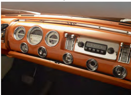
Dash features a roll down cover to "hide" the instruments and controls.

Behind the Boano Torino script is the Boano family crest. An interesting feature of the car is a drawer where the spare tire and jack are located.