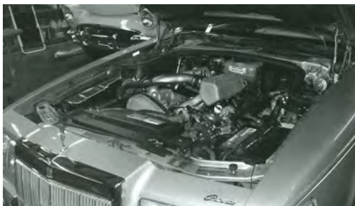
Mark VII engine bay with the BMW diesel

In 1979, before Ford knew how bad the General Motors Corp. diesels would turn out, they began making plans to offer Lincolns with turbo-diesel engines. Diesels were slated to appear in 1984 Continental Mark VIIIs and Continentals, and by that time any American diesel, no matter how good, would have the reputation of a bathtub Packard with Nash seats that turned into a bed.