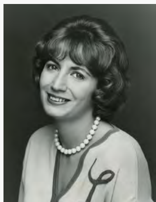
Penny Marshall 1943 - 2018