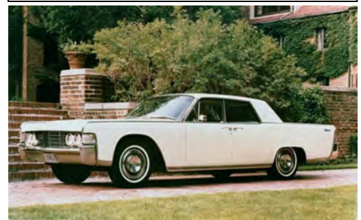
The much loved, truly iconic 1961 Continental, still looks good 58 years later.