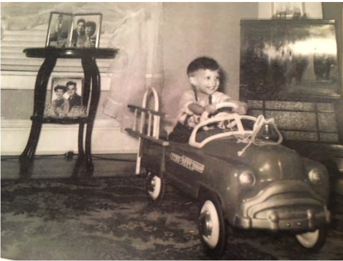
A very young "Car Guy"