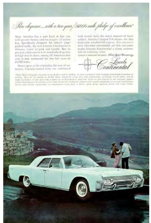
Elegant advertising of Lincoln for 1961

easier, but to many were just confusing, and jutting body lines that changed considerably during the three year styling series in an attempt to improve sales. They weren't bad looking cars, especially considering what else was being marketed at the time, but they weren't setting sales records either. So to many Lincoln customers of the past, the fact a new model year was upon them was hardly the motivation necessary to rush to the Lincoln showrooms.