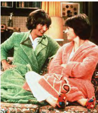
Laverne and Shirley

cast Marshall and Cindy Williams to guest on an episode of that show. The installment, titled "A Date with Fonzie," aired November 11, 1975, and introduced the characters Laverne DeFazio and Shirley Feeney (played by Marshall and Williams, respectively). In that episode, Laverne and Shirley were a pair of wise-cracking brewery workers; who were dates for Fonzie (played by Henry Winkler) and Richie (played by Ron Howard). The pair were such a hit with the studio audience that Garry Marshall decided to co-create and star them in a successful spin-off, Laverne & Shirley (1976-1983).