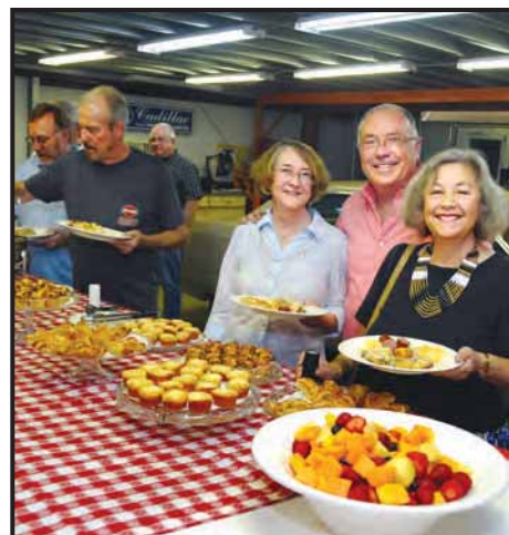
The buffet brunch line.