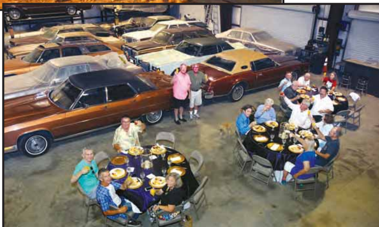
Brunch in the Cadillac- Lincoln Warehouse.