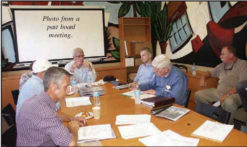
Photo from a past board meeting.