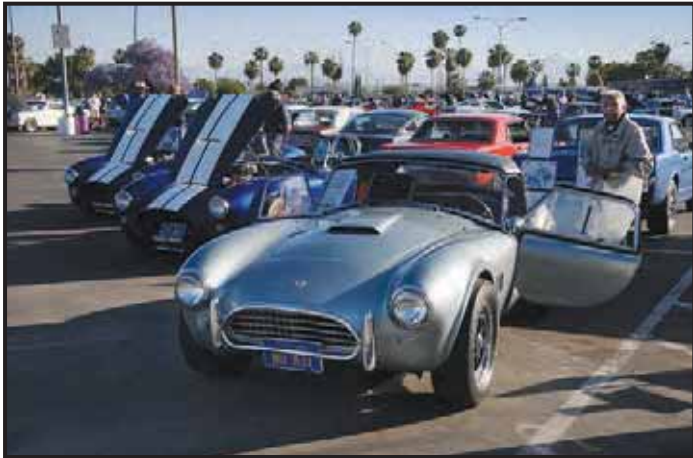
A group of Shelbys.