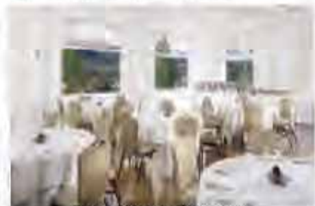
The Music Room

For our buffet, we have reserved 'The Music Room' which has large picture windows that look out over the town and the Rocky Mountain National Park.