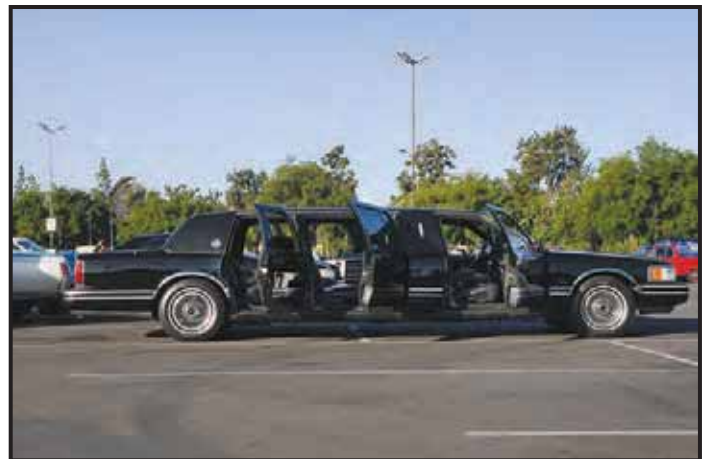
The Limousine has three doors on each side. It was built by Sayers and Scoville, which reportedly is the oldest coachbuilder in the world.