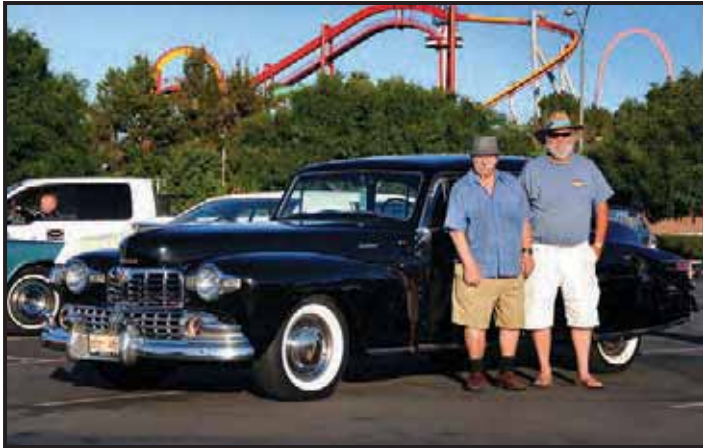
Two non-members with their late Forties Lincoln Continental Coupe.