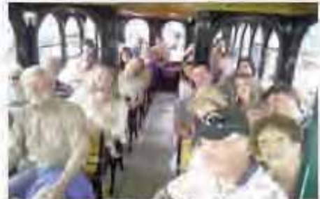
Estes Park Trolley

a motorized trolley excursion of the town and surrounding area. Each tour will take about 1-1/2 hours, so you will have time for both, in whichever order you choose.