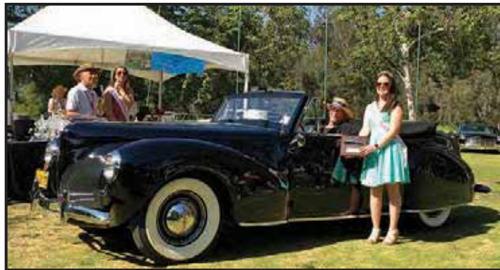
Elliot Jones' 1940 Lincoln Continental Cabriolet.

Once again our Lincolns will have our own grassy area with plenty of shade trees. See the registration sheet on Page 5 of this issue of the Confab . Register now.