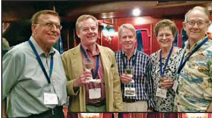
Some of our gang in the dining room on the Dinner Cruise.

Gents and Carol: We just returned from a wonderful meet in San Diego even if the weather was not typical, as it was very humid! There was only slight drizzle one morning but that certainly did not dampen the spirits of the attendees. The Western Region outdid themselves with great events and a convenient location with a great show field that was adjacent to the hotel rooms and the Hospitality suite. There were many tours both long and short that allowed the members to pick options that suited their needs which included some stunning private automobile collections. The harbor cruise (which we did not attend) was a hit with the people who enjoyed the views from the harbor and the food.