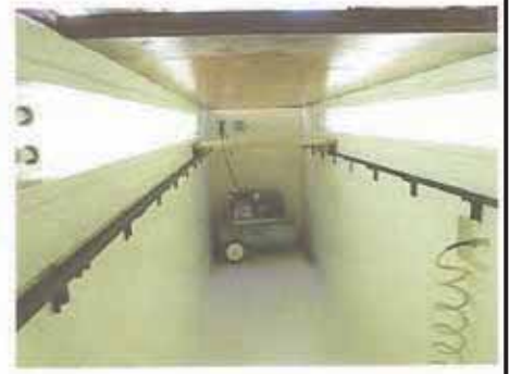
Service Pit & Compressor