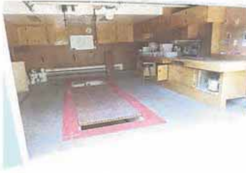
Garage with Service Pit