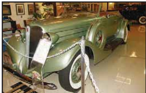
1935 Lincoln Roadster at Only Yesterday.

One of the five auto collections we visited on our museum tour on Wednesday, October 14 was "Only Yesterday" in Sorrento Valley. This is a very private collection of classic automobiles and is not open to the public. It has an incredible assortment of rare and exotic cars including rare