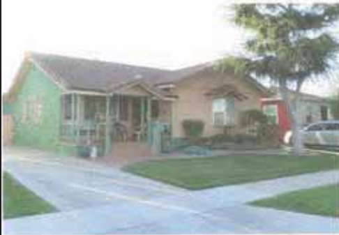
3685 Lees Avenue, Long Beach