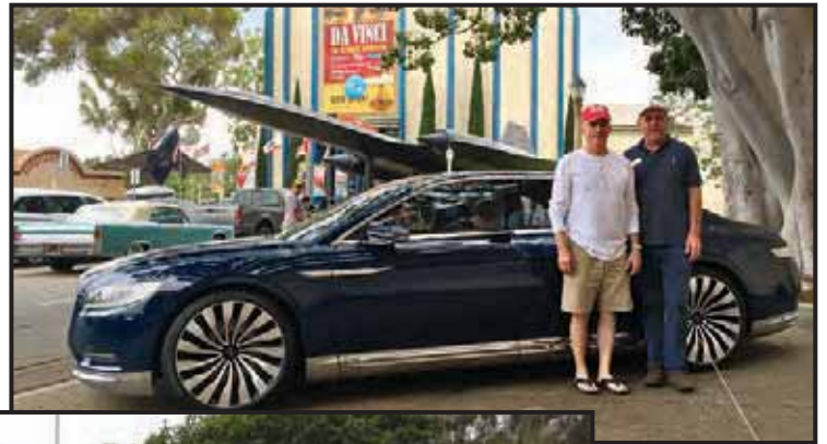
Members with the Lincoln Continental Concept Car Sunday,