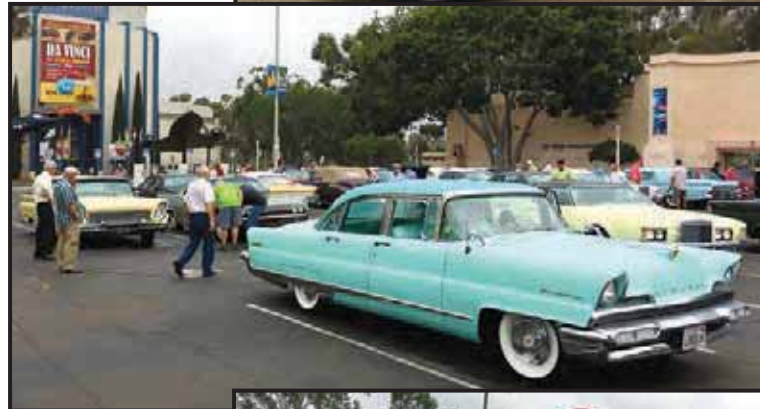
Cars at the San Diego Auto Museum Friday.