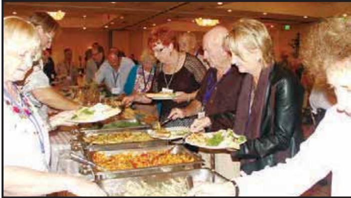
Friday night Mediterranean Buffet Dinner.