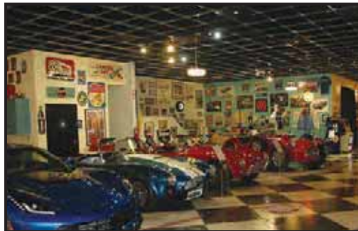
A row of rare Shelybs at Only Yesterday.

This auto collection seems to be focused on investment. The owner and his tour guide spoke at great length on how they make their car profit selling at the big time auctions, but they never buy at them. They look for cars that are extremely rare and desirable but are only 90% restored, then they make their return bringing the cars the final 10% of the way to super fabulous condition. They spoke on what makes a car rare and desirable to auction buyers and how so many collec-