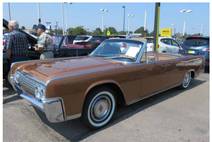
Greg Palinckx's 1964 Bronze Convertible