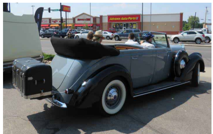
The 1937 K Model Heading Out