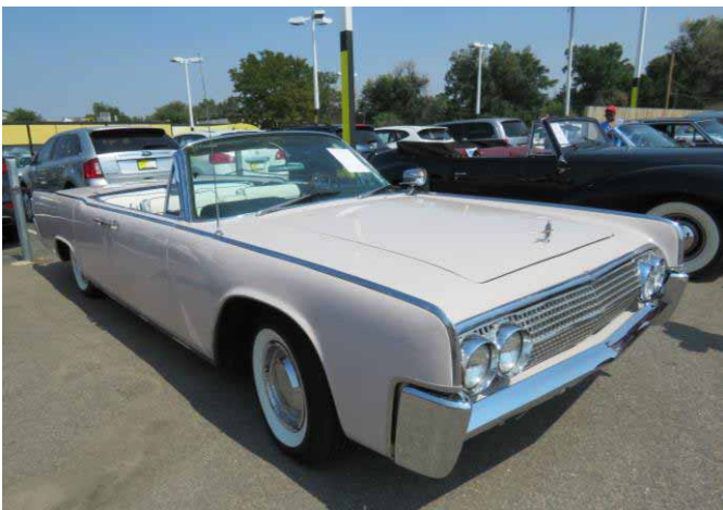
Wiley Price's 1963 Pinkish/White Convertible