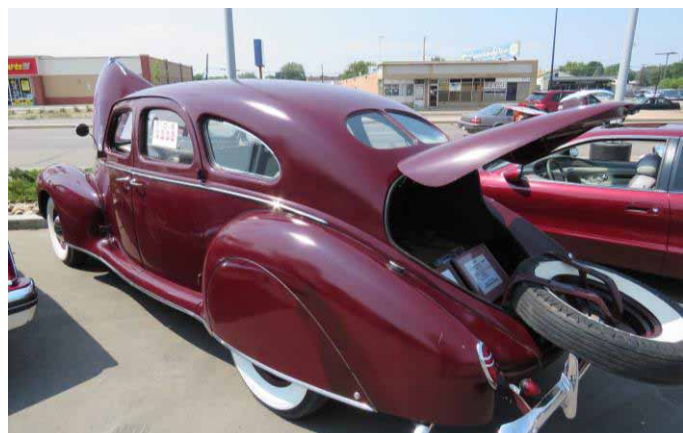
d'ya suppose that spare gets in the way?