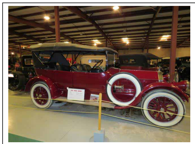
1920 Pierce Arrow