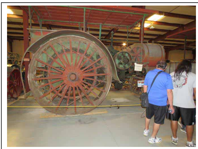
One Big Honkin' 1916 Aultman & Taylor 21,200 lb. Tractor