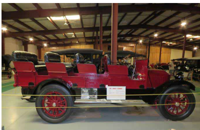
1915 Stanley Steamer Mountain Wagon