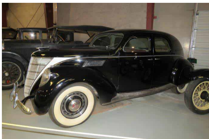
1937 Lincoln Zephyr

The museum is open on Fridays, Saturdays and Sundays from 11:00AM to 5:00PM in June, July and August only.