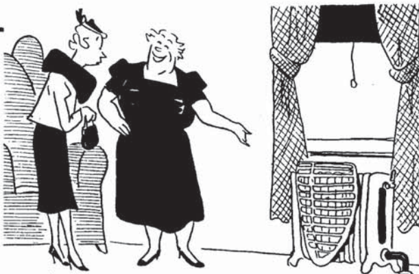
"Charlie bought me grilles for all the radiators!"