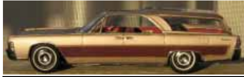
The Welcome Wagon