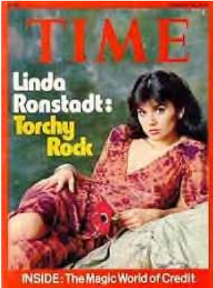
Linda Ronstadt American Pop Singer