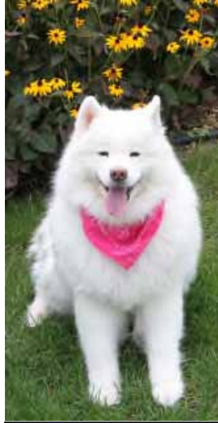
Sweet Olga is enjoying a nice sunny day at one of Burnsville's parks near our home. A girl likes to get out of the house once in a while.

I was not able to make it over to Dearborn for the first few days, but those who did report that they really enjoyed their stay at the iconic Dearborn Inn. I have stayed there several times, the first being in the 70s. It has always been a nice experience. I have heard that the tours were good and those who visited the Henry Ford Museum enjoyed it very much. The Ford museum encompasses 250 acres and over 26 million artifacts. Included in the complex is the Greenfield Village and the Rouge factory and tours are available for all three. If you enjoy transportation and want to learn more about the role technology played in the development of our country, you will want to visit the Henry Ford Museum. Plan for being there most of