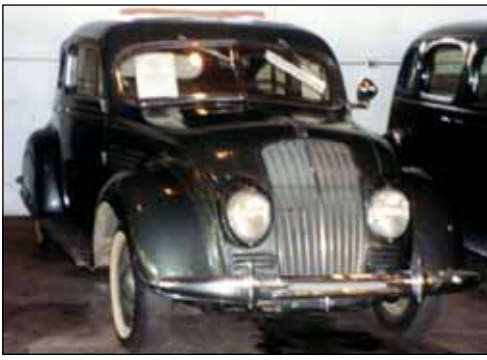
Rare, 1934 Desoto Air Flow Coupe

The Dapkus pictures again show our members enjoying their time together with our favorite subject cars! Note the very rare 34 DeSoto Airflow coupe.