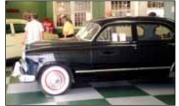
Cars at old dealership