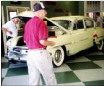
Members viewing the old cars in Clinton