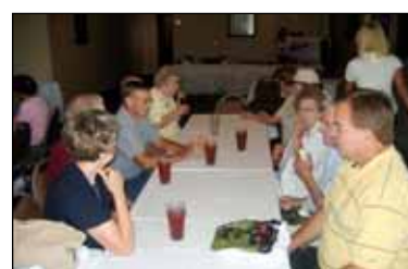
Lunch and meeting at Dublin Pub