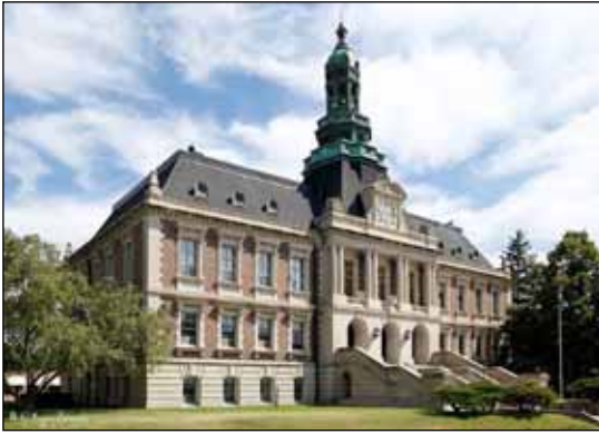
The beautiful Hall County Courthouse in Grand Island, Nebraska