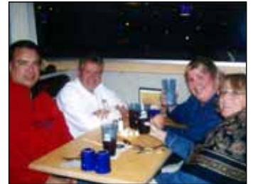
The Sailor's and the Wilson's at Dick Clark's