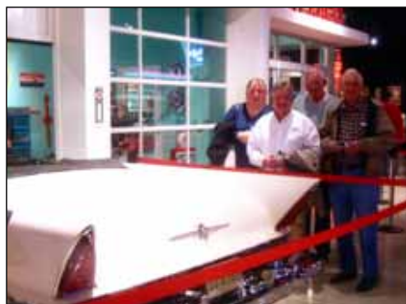
At Dick Clark's Amercian Bandstand in Branson, look at that '57 Lincoln!

Our Annual Meeting and Holiday Party was again held in Branson. A nice group of members met at Stonebridge Resort and we conducted the Business that needs to take place each year. The