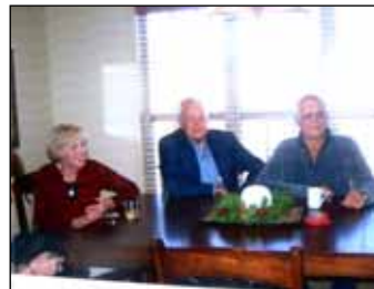
After brunch at Branson Meeting