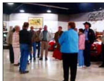
Listening to narration on Morrison Collection