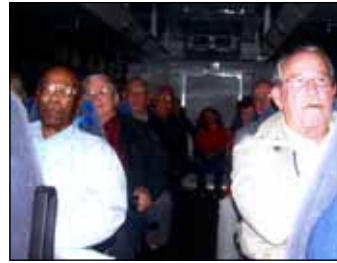
Branson Bus Ride