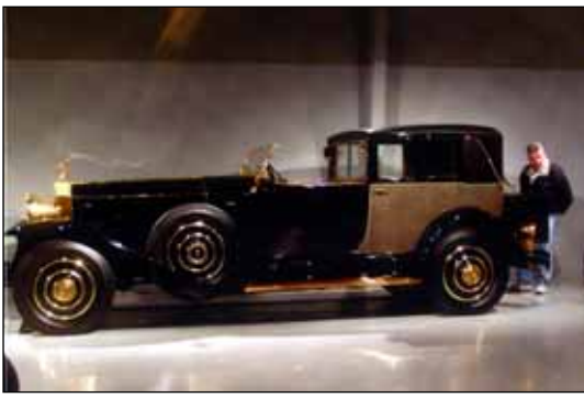
Gary Sailor inspecting a gold Rolls Royce at Morrison Collection