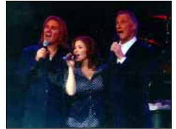
Bill Medley and family at Dick Clark's American Bandstand