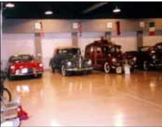
Morrison Collection at Salina, Kansas