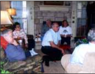
Annual Meetin held in Branson