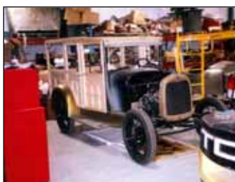
Wood restoration at McPherson College