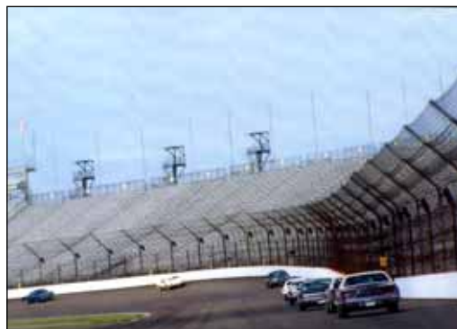
Lincolns at the Indianapolis Track