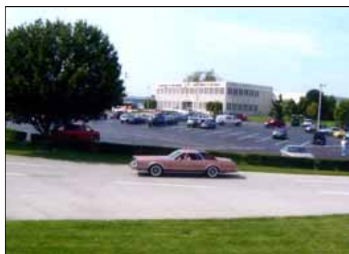
Indy 500 museum at National Meet