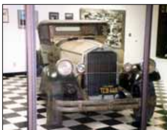
1930 Pace Arrow before restoration at McPherson College