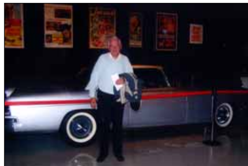
We had one just like this '57 Mark II