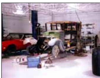
Restoration shop at McPherson College