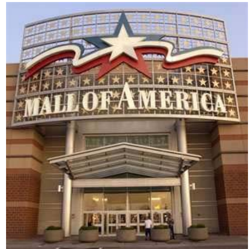
Bloomington's Mall of America Shopping without Limits