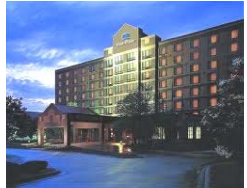
Park Plaza Hotel

Thursday we will have a full day of activities, beginning with driving tour to the Midwest’s most outstanding private classic car collection with over 150 cars. We will be able to also see one of the best collection of 50’s automotive billboard signs and a beautiful display of Coke memorabilia. We will tour the Lake Minnetonka area ending with a tasty lunch close to the lake. Driving tour will feature Peoples Choice Awards for each Decade and Best of Tour, for all Lincolns driven on tour. If you are not going to drive a Lincoln on tour you still can go, you will be able sign up to ride in one of the Lincolns driving in the tour. Thursday night will