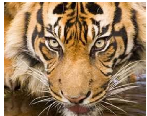
See the Tigers at the Minnesota Zoo