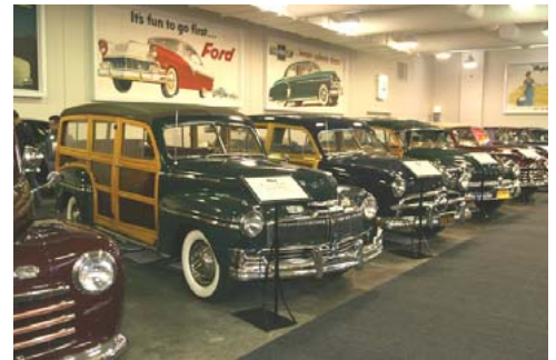
Premiere Car Collection