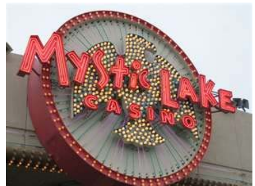
Mystic Lake Casino in nearby Shakopee is but a short shuttle ride from the Park Plaza Hotel.